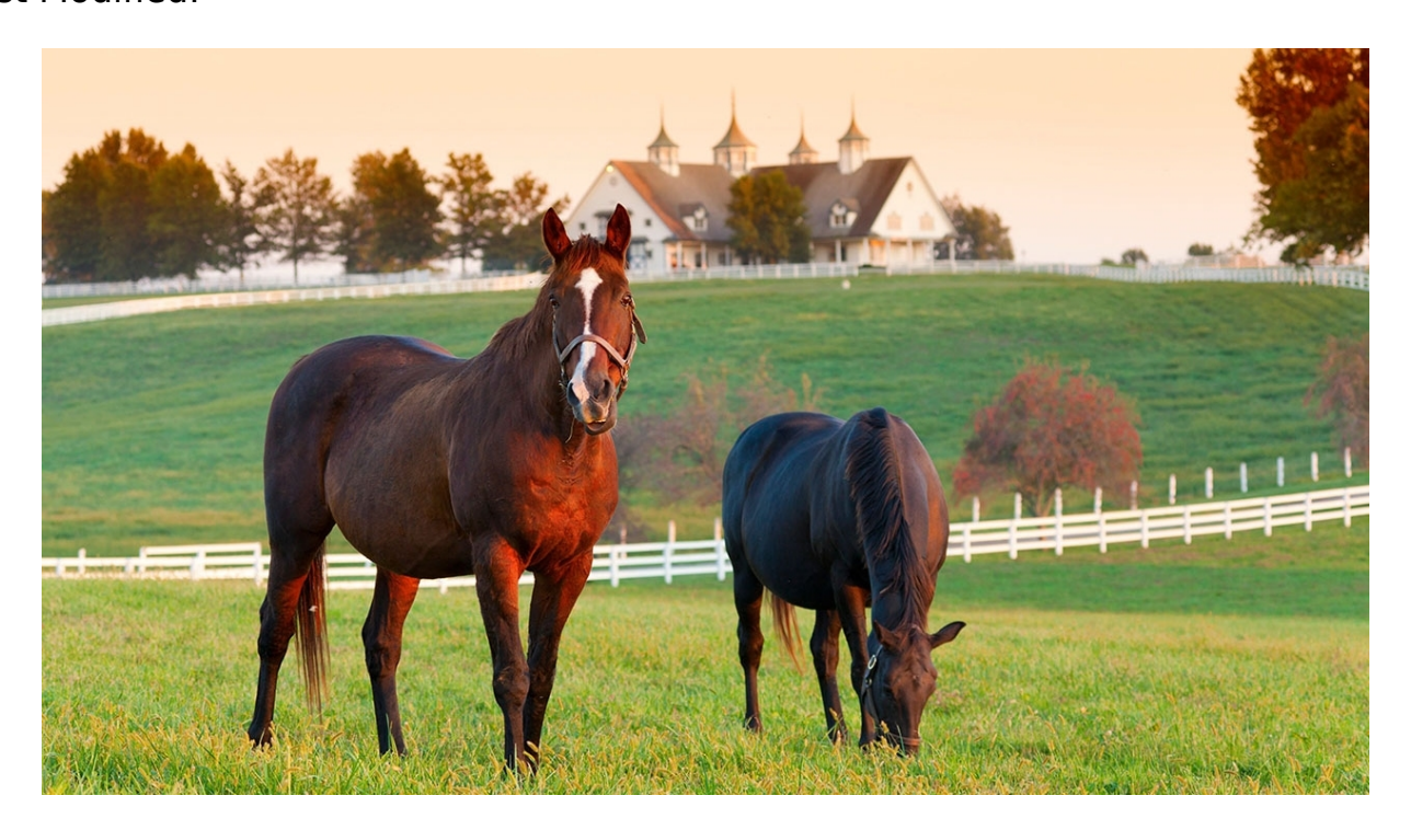
The U.S. Department of Agriculture (USDA) regulates the importation of equines and their hybrids into the United States. Equines are defined as horses, mules, donkeys, asses, and zebras. Germplasm includes semen, embryos, oocytes, and cloning tissue.