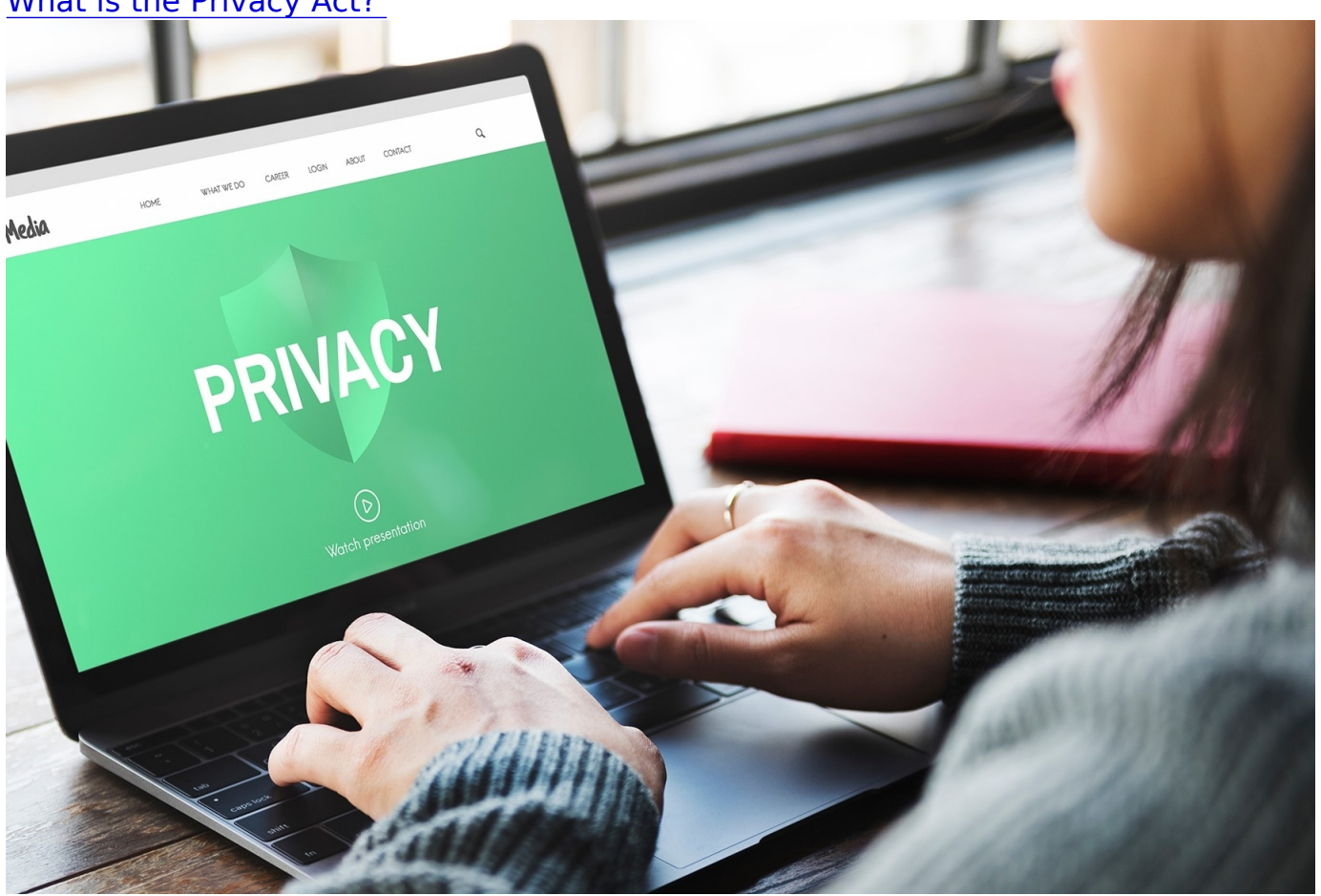
Privacy Threshold Analysis, Impact Assessments, System of Records Notices