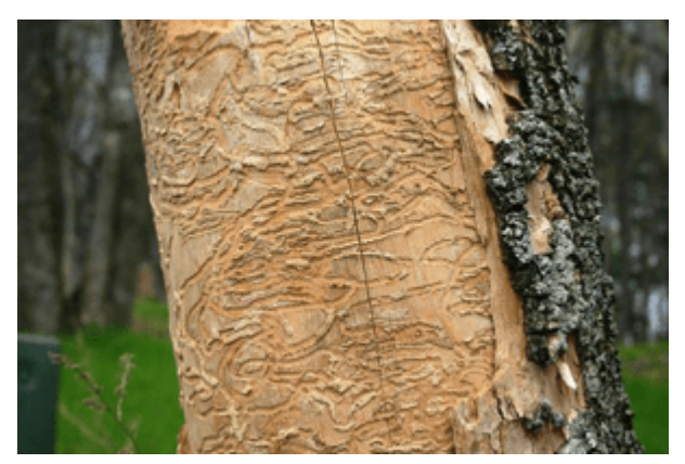
Larva Damage (S-shape)