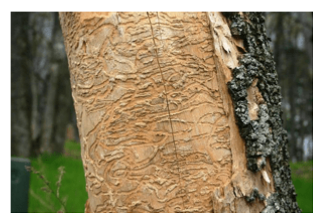
Larva Damage (S-shape)