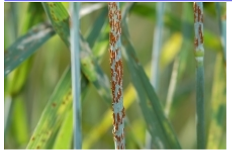
Chrysanthemum White Rust