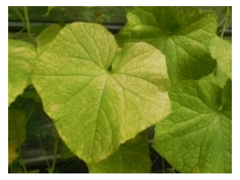
European Larch Canker