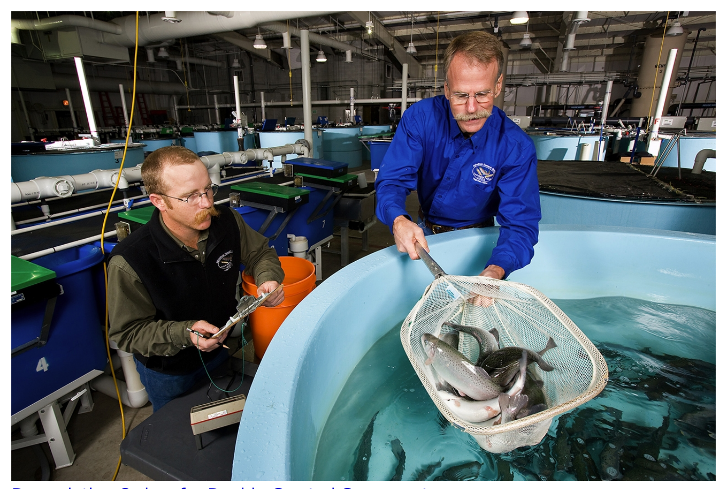
<u>Depredation Orders for Double-Crested Cormorants</u> <u>Learn about the U.S. Fish and Wildlife Service's aquaculture depredation order and how it aids work to control double-crested cormorant populations in certain States.</u>