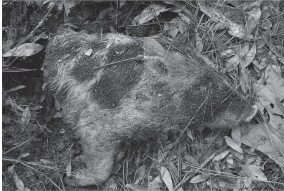
Fig. 3. Depredated wild piglet ( Sus scrofa ) found cached in a manner suggesting that the piglet was killed by a coyote ( Canis latrans ), Savannah River Site, South Carolina, USA, 2015.

of VITs in conjunction with GPS collars or triangulation might allow greater research into the natural history of wild pigs and how movement relates to parturition (Kurz and Marchinton 1972; Baubet et al. 2009).