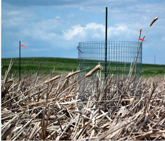
Figure 1. Woven wire cylinder surrounding blackbird nest.