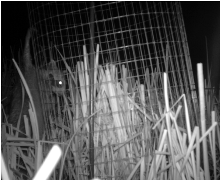
Figure 2. Digital infrared image of raccoon climbing woven wire cylinder.

We visited the nests two to three times per week and recorded number of eggs, chicks, cowbird eggs, latitude and longitude, and nest fate (abandoned, depredated or fledged). Nest abandonment was determined according to several possible outcomes. An abandoned nest had to be undisturbed with one or more of the following traits: no