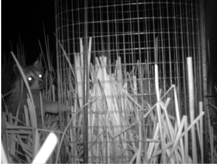
Figure 5. Photographic evidence of raccoon navigating through woven wire cylinder.