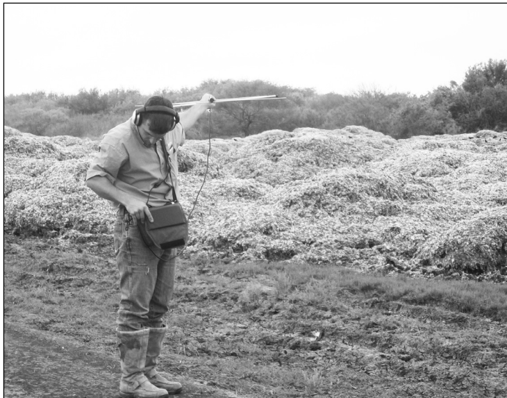
Figure 1. Study personnel using ground-based radio-telemetry to locate feral swine at a whole-cottonseed storage site in Kleberg County, Texas, during February 2008.

We collected samples of cottonseed from various areas at the storage sites where feral