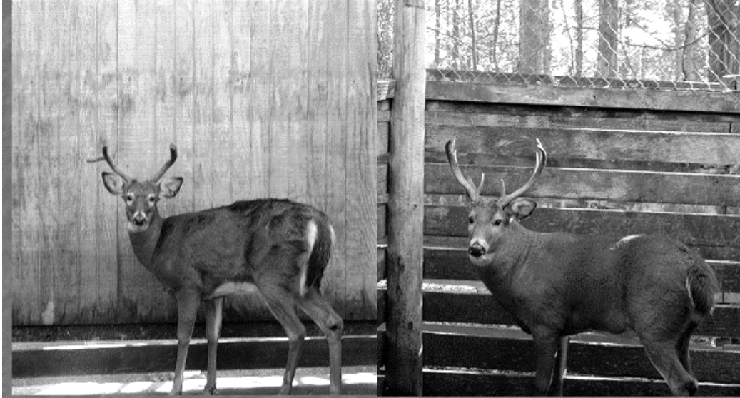
Figure 2. A comparison of body mass of males in the breeding season a GnRH vaccine treated male (left) and a control male of similar age.