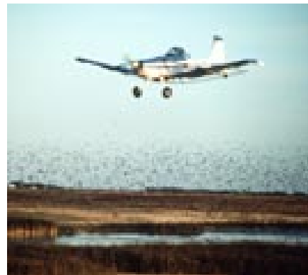
Airplanes can be used to scare blackbirds.

Harassing feeding blackbirds with an airplane can sometimes be an effective method of chasing flocks from sunflower fields. This technique appears to be most effective if combined with other mechanical methods on the ground, such as shotguns or pyrotechnics.