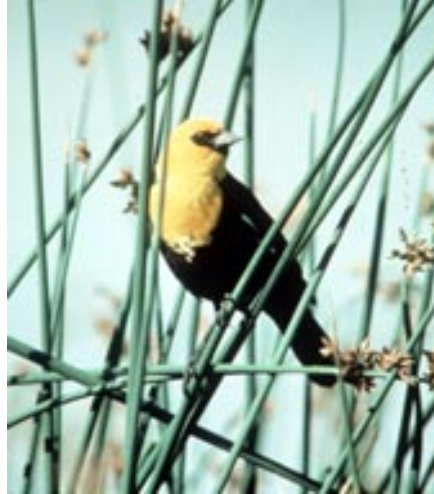
Yellow-headed blackbird (mature male).

A robin-sized bird, the male yellowhead has a black body with a conspicuous yellow head and breast and a white wing patch seen only when the bird is in flight. The female is smaller and browner with yellow throat and breast and does not have a white wing patch. Yellowheads are locally abundant nesters in deep-water marshes of the northern Great Plains and western North America. Like redwings, male yellowheads often mate with more than one female. This species feeds extensively on insects during the nesting season and in late summer and fall on weed