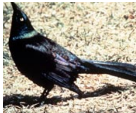
Common grackle (mature male).

Common grackles are slightly larger than robins, with iridescent black feathers and a long keel-shaped tail. The male, slightly larger than the female, has more iridescence on the head and throat. Grackles are common nesters throughout North America east of the Rockies, nesting in shelterbelts, farmyards, marshes, and towns. The male grackle usually mates with one female. Flocks feed in fields, lawns, woodlots,