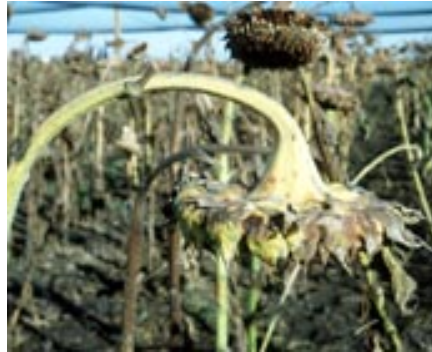
Sunflowers with concave heads, horizontally oriented heads, and long head-to-stem distance appear to suffer less damage from birds than other varieties.

Corn hybrids vary greatly in their susceptibility to bird feeding. Hybrids of corn with long husk extension and thick husks have been shown to be more resistant to damage than other hybrids. Sweet corn is vulnerable to blackbirds for only a few days before harvest and, thus, may be easier to protect than field corn and sunflower.