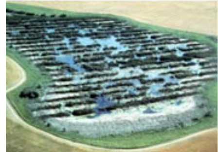
Cattail marshes can be managed using a registered aquatic herbicide to disperse roosting blackbirds.

Cattail marshes used as roost sites for blackbirds can be sprayed with glyphosate (®Rodeo Aquatic Plant Herbicide) to reduce the density of the cattails, which reduction in turn disperses the birds. Rodeo is the only herbicide registered for controlling cattails growing in standing water. (Other herbicides are available for use on cattails growing in marshes without surface water.) Generally, cattails must be treated 1 year