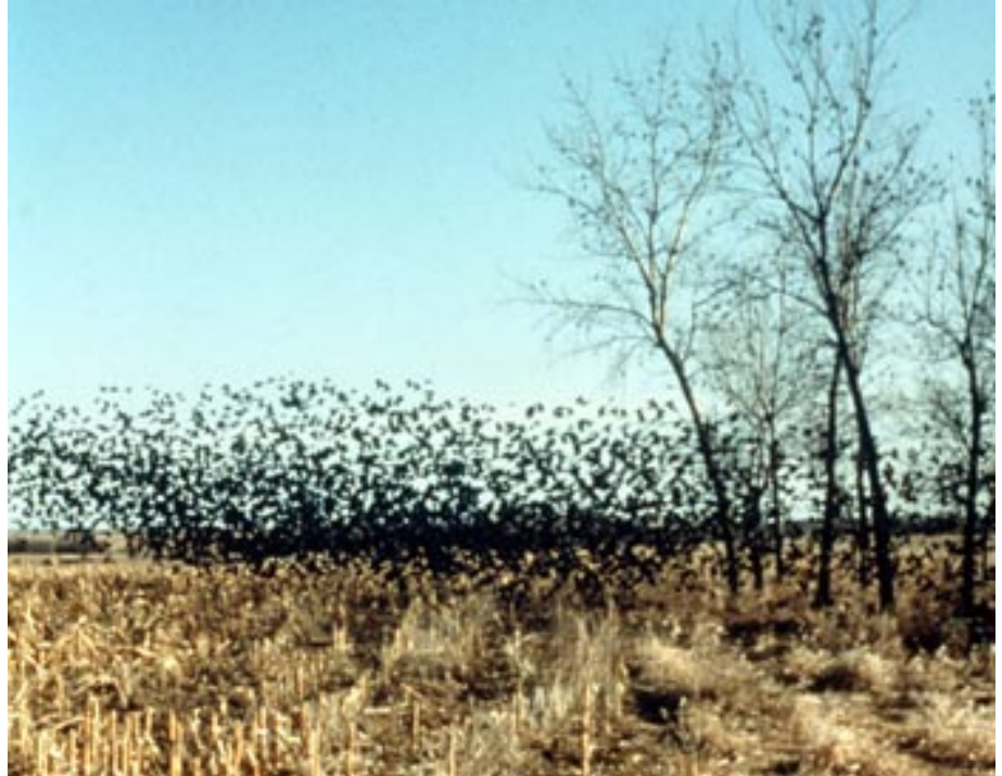
Blackbirds often use alternate feeding sites when available.

In late summer, after the nesting season, blackbirds form flocks and roost at night in numbers varying from a few to over a million birds. These flocks and roosting congregations are sometimes comprised of a single species, but often all three species mix together. Although some blackbirds roost in trees in the northern Great Plains, the birds prefer to roost in dense cattail marshes. Between 40 and 50 percent of the blackbird population dies every year. But these mortality figures are offset by the birds'