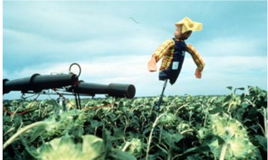
A propane exploder and a popup scarecrow powered by carbon dioxide.

devices mandates that farmers persistently scare the birds before their feeding patterns become well established. Devices need to be employed especially in the early morning and in late