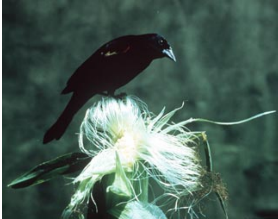
Red-winged blackbird (immature male) on an ear of corn.

Red-winged blackbirds are the most numerous breeding blackbird in the Dakotas and Minnesota and perhaps the most abundant bird in North America. The male, a little smaller than a robin, is black with red and yellow shoulder patches. The brownish female, which is smaller than the male, is often mistaken for a large sparrow. Redwings nest throughout North America in marshes, hayfields, and ditches. Often adult males mate with more than one female. Insects are the dominant food during the nesting season (May–July), with the diet shifting to predominantly grain crops and weed seeds in late summer through winter. Redwings from the Dakotas and Minnesota migrate to the lower Great Plains and gulf coast region in winter.