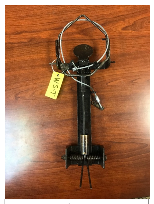
Figure 4. A coyote WS-T foot cable restraint with a WS-T throw-arm, which incorporates a foothold trap pan and pan-tension device.