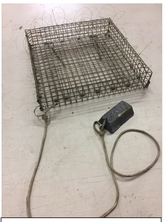
Figure 6. A flat topped bal-chatri, showing the variation in styles, which could be used for birds as large as eagles.

In 1996 the Association of Fish and Wildlife Agencies (AFWA), working cooperatively with federal and private partners, embarked on a goal to develop voluntary Best Management Practices (BMPs) for trapping furbearers in the United States (Batcheller et al. 2000). The stated purpose and intent of AFWA in developing the BMPs was to: "Scientifically evaluate traps and trapping systems used for capturing furbearers in the United States." AFWA determined the best methods by species<sup>3</sup>, but primarily targeted harvest by private fur trappers and not WDM take. Evaluations of trap and snare performance were based on animal welfare, efficiency, capture rate, selectivity, practicality, safety, mechanical function, cost, quality, durability, weight, and maintenance requirements (Fall 2002). Scientific research on the variety of traps and snares was used by AFWA to develop the BMPs. The evaluation of BMPs continues and BMPs are updated as research results warrant (AFWA 2017). The BMPs were provided to state and federal wildlife agencies, trappers,