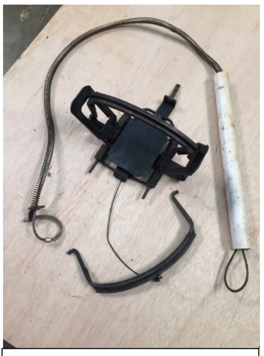
Figure 3. A mechanical foot cable restraint, the "Hold-a-Hog Device," with a disengaging jaw.