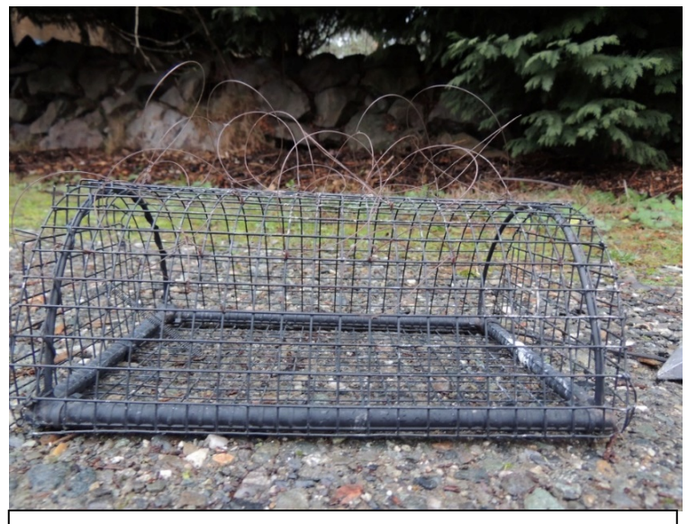
Figure 5. Typical bal-chatri trap, a foot noose trap with monofilament line at top and on sides. The trap is baited with a live mouse or bird.

Foot noose traps are different from other cable devices because they incorporate many foot nooses made of monofilament fishing line (usually 20-100# test weight dependent on the target species). These are attached to a cage (Figures 5 and 6) with a live lure (prey), mats that are set along shoreline or perches, or pigeons tethered to a one-pound weight (heavier for eagles) fitted with a harness covered in nooses. Unlike snares, these are monitored frequently when in use. Birds,