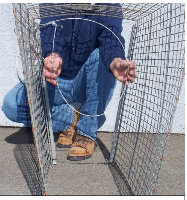
Figure 1. A mountain lion neck snare made with 3/32" cable with a cage to exclude nontarget animal such as bighorn sheep and deer.

Cable devices may be used as lethal (snare) or livecapture (cable restraint) devices depending on how or where they are used. Snares are typically set to close around the neck of an animal (Figure 1) and are usually intended to be a lethal method, whereas cable restraints are set and positioned to capture the animal around the leg or foot and intended to livecapture the animal (Figures 2, 3, and 4). Monofilament line traps ( e.g. , bal-chatri and noose mats), which are live-capture devices, are used to snare the foot or feet of a bird and usually placed so that they alight on the ground without injuring themselves (Figures 5 and 6). Terms and illustrations of the different parts of a cable device as well as sets can be found in Olson and Tischaefer (2004), but are generally depicted in Figure 2. Cable devices are also placed so that the animal, especially if it is to be livecaptured, does not become entangled into an exposed root, woody vegetation, or post within reach of the animal that is on an extended cable; entanglement with an item usually larger than a half