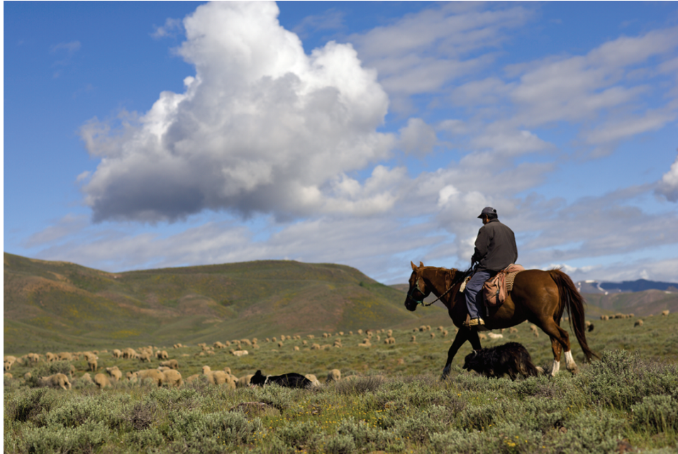
Fig. 1. —Lava Lake herder and herding dogs among the sheep.

unprotected areas, though the sheep are counted during shipping and at the end of the grazing season, which makes this scenario unlikely.