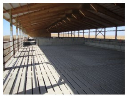
Confinement barn with bedded pack