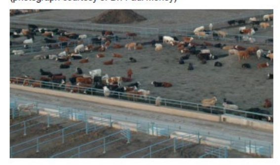
Wind fence

Open dry lot