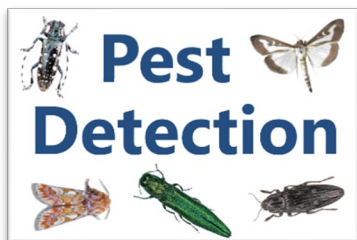
Pest Detection Program thumbnail