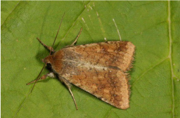
Figure 2. OWB adult moth.

threshold temperatures and the accumulated degree days as inputs for insect phenology models (USDA APHIS 2020). In Illinois, phenology models indicate OWB may have up to three generations per year, with one overwintering generation and two generations completed during the summer and fall seasons.