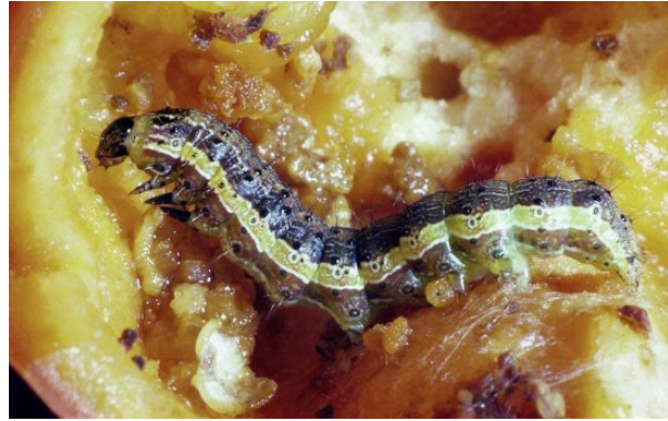
Figure 3. OWB larva