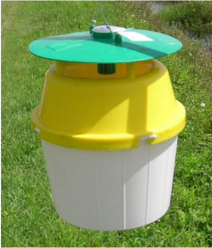
Figure 4. Tricolor bucket trap with a label on the lid that indicates it is a Program trap with a phone number for questions.

2023 field season. In subsequent years, traps will be placed at locations and in a manner that best suit the most recent available detection data.