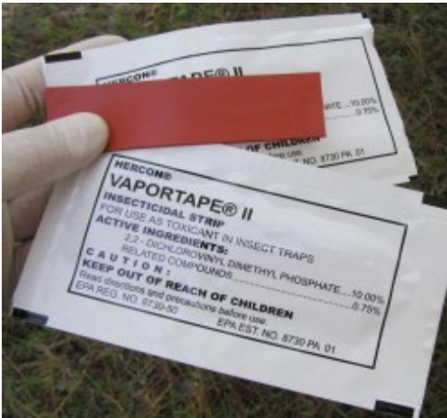
Figure 6. Vaportape II insecticidal strip.