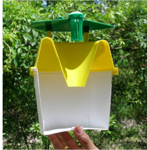
Figure 5. Bucket trap cut in half to show its interior and size. The bucket traps are small, which limits the nontarget species that can be taken.