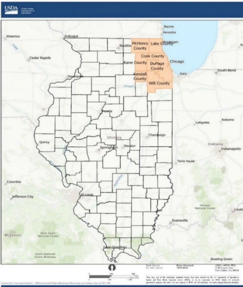
Figure 1. The Proposed OWB Program area includes Cook, DuPage, Kane, Kendall, Lake, McHenry, and Will Counties, Illinois.

This environmental assessment (EA) proposes a course of action to eradicate OWB from Cook and DuPage Counties and prevent its spread within the state or elsewhere in the United States where it can cause adverse impacts to agriculture and natural resources. This EA also includes the five neighboring counties (Kane, Kendall, Lake, McHenry, and Will Counties) that border Cook and DuPage Counties (Figure 1).