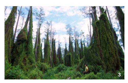
Figure 3 Environment infested with Lygodium microphyllum

These climbing ferns spread prolifically, scrambling over vegetation, creating a fire hazard, smothering native plant communities and causing other harmful environmental and economic impacts.