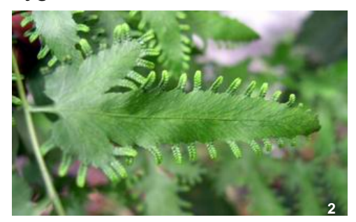
Figure 2 Fertile fronds with sporangia