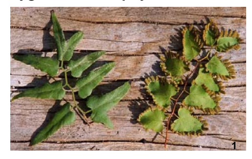
Figure 1 Fertile and sterile fronds