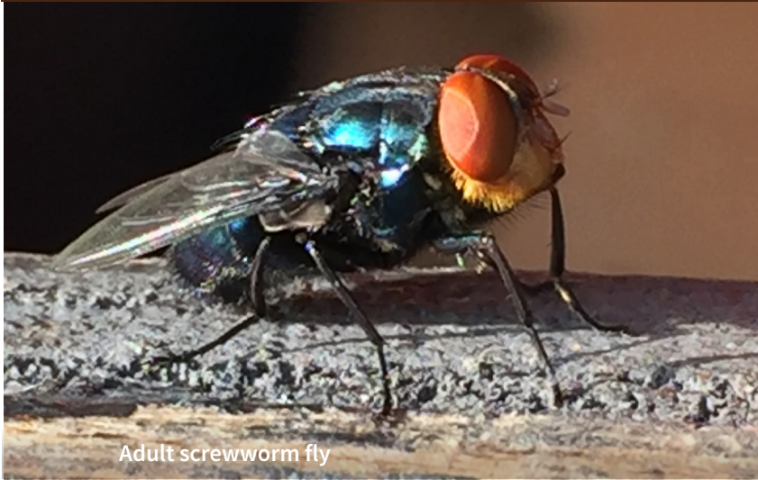
Adult screwworm fly