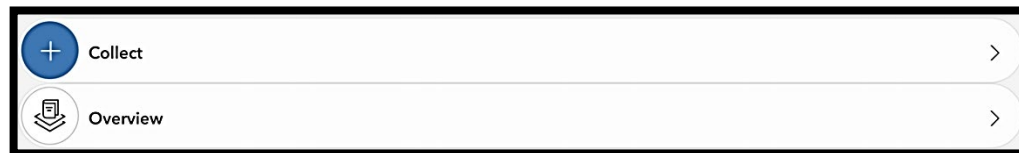
Collect and Overview bars

Select the “Collect” bar to enter a new aircraft inspection.