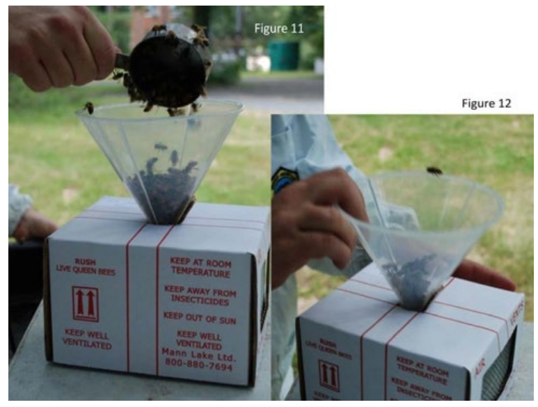
Figure 11: Place bees from cup into funnel inserted in the live bee shipping box. Figure 12: Gently tap live bee shipping box and funnel so bees are forced into the collection box.