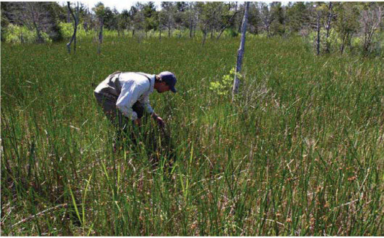
A small bay area along Maryland's Chesapeake Bay shows recovery in the 2 years after invasive nutria were removed by Wildlife Services biologists and specialists.

in color although occasional light colored and albino animals are observed. Because nutria spend much of their time in the water, they are highly adapted for a semi-aquatic existence.