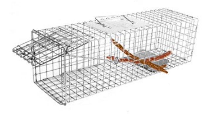
Figure 9. Stepping sticks placed in front of the pan force cats to step on the pan and trigger the trap.

corridors in order to maximize the chance of a cat encountering a trap. Consult Vantassel and Meyer (2017) for tips on the use of cage and box traps.