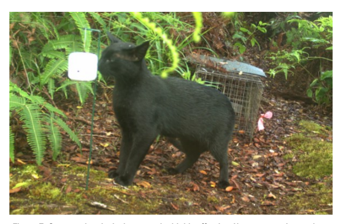
Figure 7. Scent and curiosity lures can be highly effective. Here an experimental lure is set outside of a trap to observe the animal's response.

Learn how to handle non-target species before initiating a trapping program by visiting the Internet Center for Wildlife Damage Management (http://icwdm.org/) or contacting a trained professional.