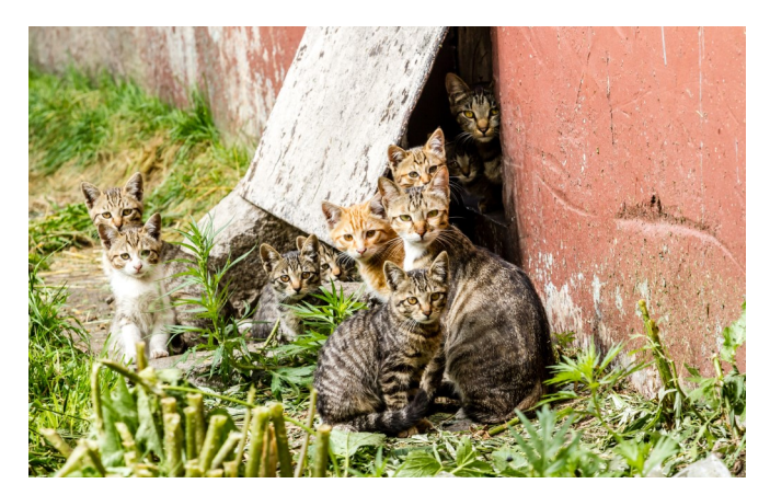
Figure 15. Den sites vary by habitat availability and may include anthropogenic structures, such as decks, sheds, and abandoned vehicles and structures.

Average life expectancy of owned cats is 13 to 17 years (Spector 1956). Spayed and neutered cats have the longest life expectancy of owned cats (Cozzi et al 2017). The life expectancy of unowned and free-ranging cats is not well understood, but free-ranging cats are more likely to be exposed to a variety of diseases including Feline Leukemia Virus (FLV), Feline Immunodeficiency Virus (FIV), and are 2.77 times more likely to be infected with parasites (and parasite-spread diseases) than indoor-only cats (Levy et al. 2006; Chalkowski et al. 2019). Factors which affect life expectancy of free-ranging cats include ownership status, presence of