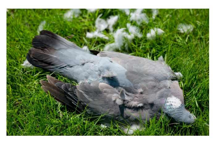
Figure 4. Pigeon killed by cat. Notice plucked feathers near carcass.