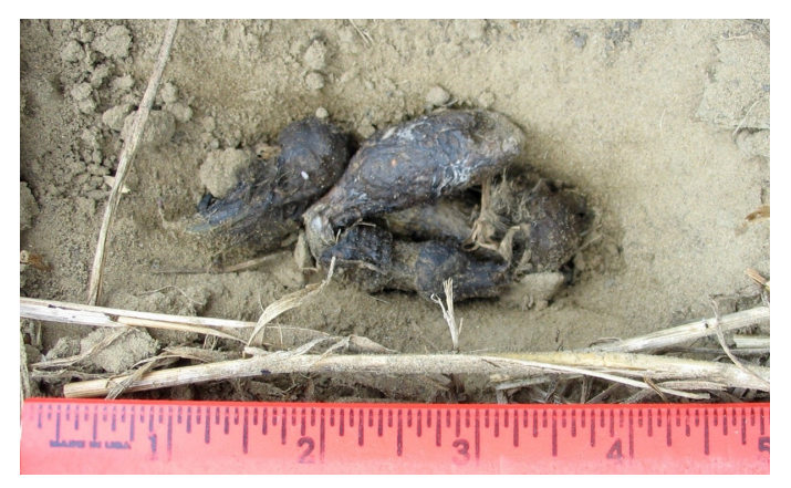
Figure 14. Cat scat.

Domestic cats are polyestrous, allowing a sexually mature female to produce up to 5 litters annually, with an average of 1.4 litters per year (Nutter et al. 2004). Females give