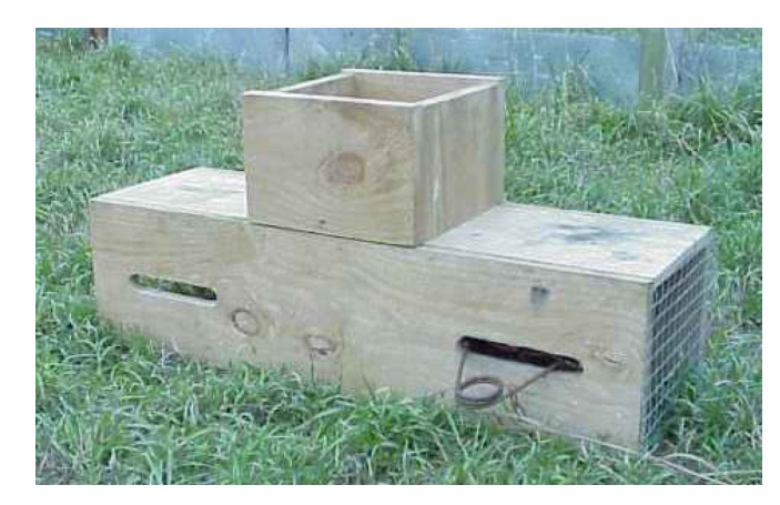
Figure 11. Chimney cubby with body-gripping trap inside. Chimney cubbies help to prevent risks to non-target species.