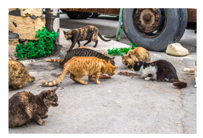
Figure 2. There are approximately 30 to 80 million unowned cats in the United States.

Up to 164 million cats reside in the United States, of which an estimated 30 to 80 million are unowned (Loss et al. 2013) (Figure 2). A large portion of owned cats are also free-ranging (Loss et al. 2013). The threat which free-ranging cats pose to native wildlife