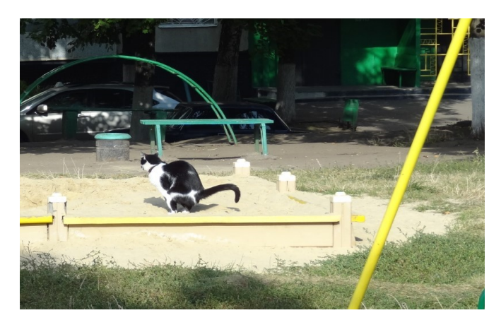
Figure 3. Cats prefer loose soil for their latrines, making sandboxes, flowerbeds, and vegetable gardens a popular spot for cats to dig up and urinate and defecate around.

Domestic cat feces have pointed ends, are sub-sectioned and can be similar in size to bobcat feces, but slightly smaller. Feces consistency will vary with diet.