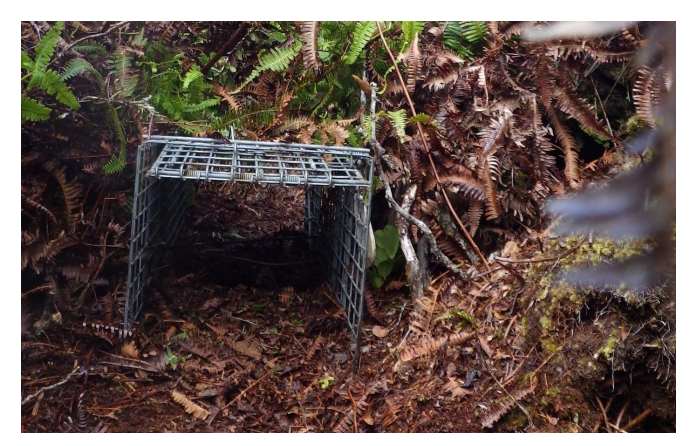
Figure 8. A properly set double-door cage trap.

Trap numbers and placement depend on the number of cats, vegetation or other forms of cover, and public exposure. Ideally, use as many traps as possible to ensure cats are caught quickly. However, traps should be placed out of view of each other to avoid "educating" untrapped cats. The denser the vegetation or the cat population, the closer together the traps should be placed. Place traps along fence lines, near congregation areas (e.g., trash collection sites, fresh water sources) and near cat travel