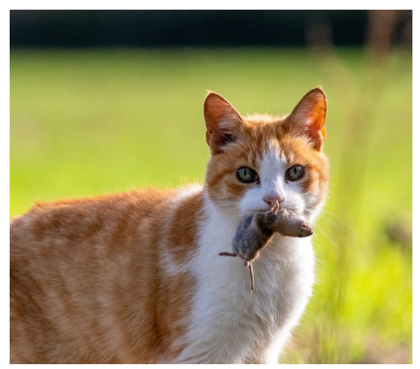
Figure 1. Free-ranging and feral cats impact native wildlife through predation, competition, and spread of disease.