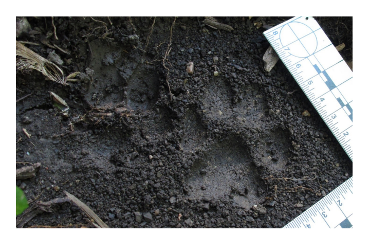
Figure 13. Cat tracks.

Domestic cats are capable of producing a variety of vocalizations to communicate with one another and with