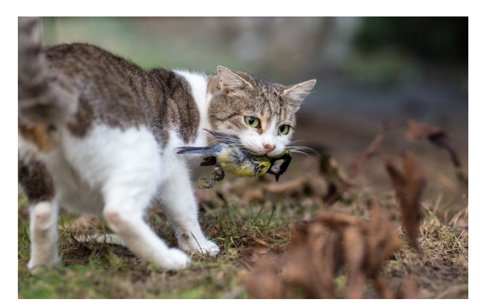
Figure 12. Domestic cats prey on birds, small mammals, reptiles, amphibians, and invertebrates in addition to eating food provided by people. Cat will kill prey even when their appetite is sated.

Predation by feral cats on birds has an economic impact of approximately $17 billion per year in the United States (Figure 12) (Pimentel et al. 2005). This assumes there are 30 million feral cats in the U.S. and 8 birds are killed per feral cat each year. Each adult bird is valued at $30. This cost per bird is based on the literature that reports that a bird watcher spends $0.40 per bird observed, a hunter spends $216 per bird shot, and wildlife specialists spend $800 per bird reared for release. This estimate does not include birds killed by other free-ranging cats or losses of other animals, such as small mammals, reptiles, and amphibians. A more recent study calculated a conservative cumulative worldwide damage and management costs for cats between 1970 and 2017 to be approximately $22 billion (Diagne et al. 2021).