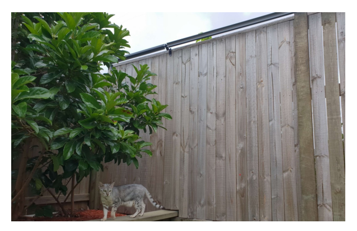
Figure 5. Oscillot $ system for preventing cats from climbing over fences.

Several non-electric fences have proven effective at excluding cats for the protection of endangered species and sensitive environments. The Xcluder® Kiwi fence consists of a 6.5 ft (2 m) wall supporting a ¼-inch wire mesh that extends the height as well as projects out at least 1 ft (30 cm) beneath the ground from the base of the fence (Figure 6) (Day and MacGibbon 2007). It is secured to the ground and covered with soil. To prevent animals from going over the top of the fence, cut a 2-ft (60 cm) wide steel hood and angle it downward with about 1 ft of metal bent back into an arc so that the plate looks like an upside-down sled runner. Use custom made brackets to hold the hood securely. Temporarily effective or ineffective