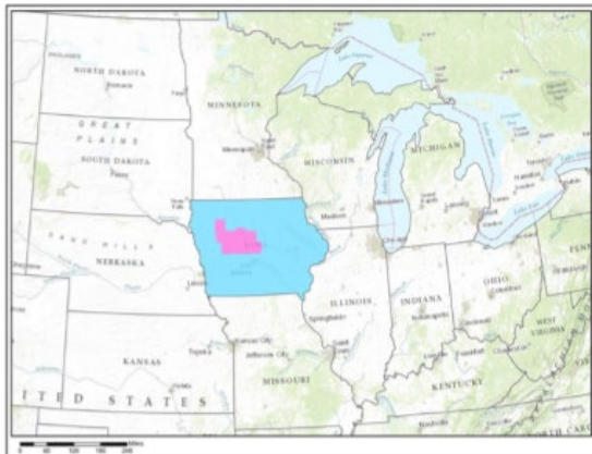
Figure 2: Example—State of Iowa with Response Zones and Susceptible Populations

In highly animal-populated areas of top agriculture States in the U.S., with both swine and cattle, the current availability of FMD vaccine would be insufficient to vaccinate all susceptible species, even in a moderate outbreak. For example, Figure 2 demonstrates that millions of doses of vaccine would be required to vaccinate swine and cattle—just in the infected zone. If the entire state were to become a vaccination zone, the estimate skyrockets.