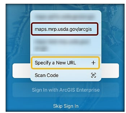
Figure 3. Sign in with ArcGIS Enterprise options

If choosing to "Specify a New URL", this is entered manually using the keyboard. Check it carefully and then tap "Ok". (Figure 4)