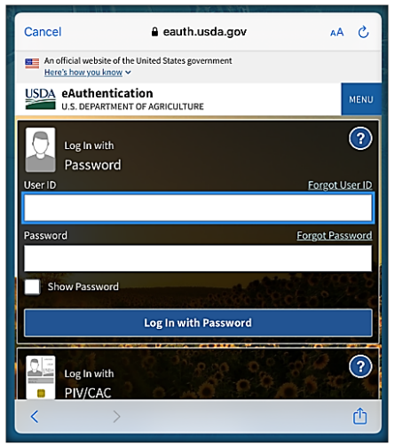
Figure 6. Sign in to USDA-MRP with eAuth Account