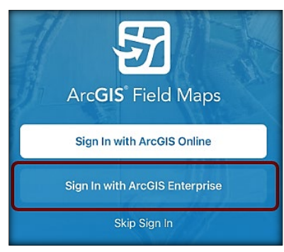
Figure 2. ArcGIS Field Maps Sign in screen

Select "Sign in with ArcGIS Enterprise".