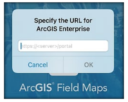
Figure 4. Specify a New URL