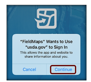
Figure 5. Confirm usda.gov sign in

Next you may be asked to confirm "usda.gov" to Sign In. Tap "Continue". (Figure 5)