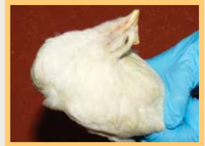
Twisting of the head and neck