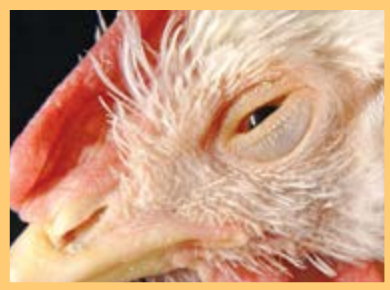
Swelling of tissue around the eye and ruffled feathers