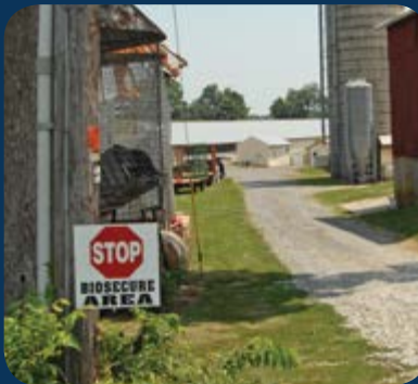
Biosecurity signage on a farm

If you or others must visit (such as service providers), make sure to wash hands and scrub boots before entering the bird area. Use and offer disposable boot covers and coveralls whenever you can.