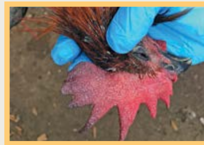
Darkening of the comb (cyanosis)