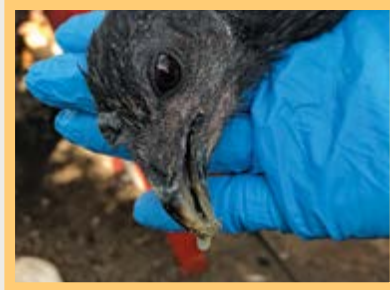
Mucous discharge from nose and mouth