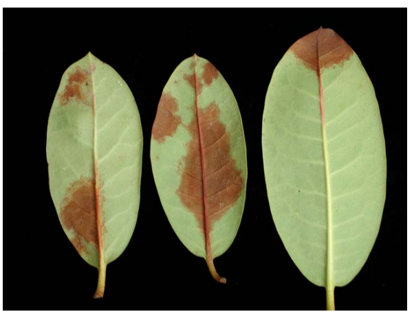
P. ramorum infected rhododendron leaves, S. Tjosvold