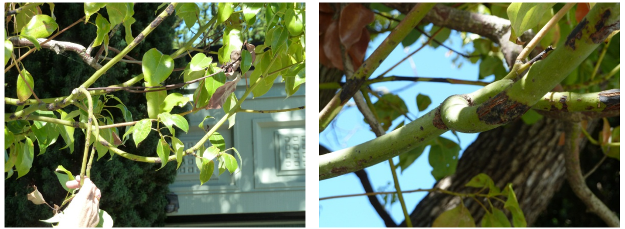
P. ramorum infested camphor tree leaves and green branches