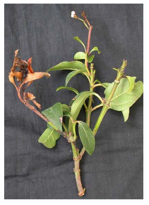
P. ramorum infested viburnum