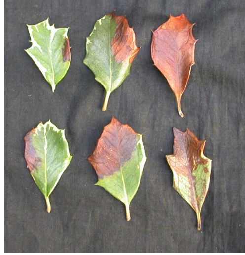
P. ramorum infested O. heterophyllus plant and leaves