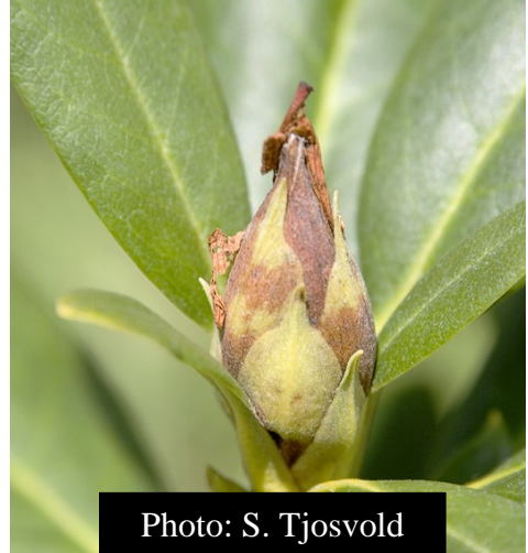
P. ramorum infected rhododendron stems and petioles. Infected rhododendron flower bud.