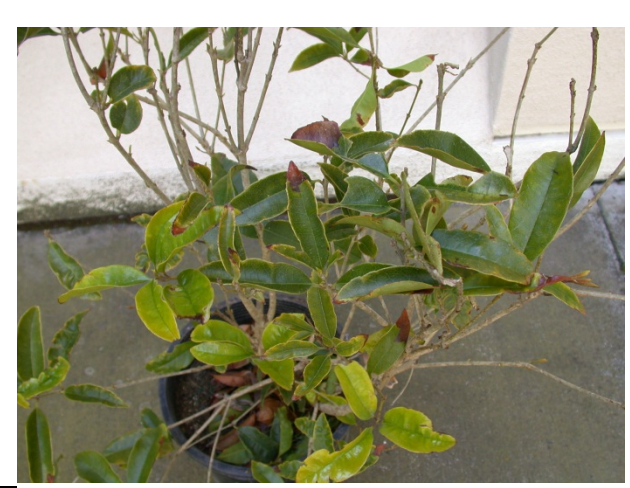
P. ramorum infested Osmanthus fragrans, C. Blomquist, CDFA