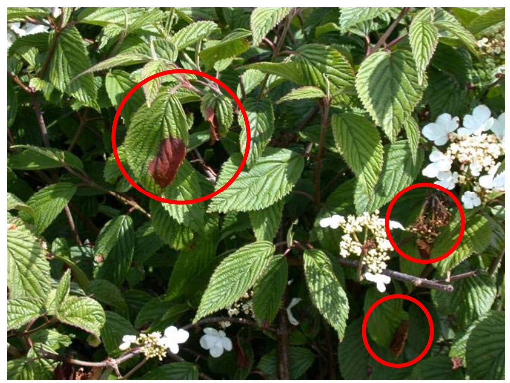
P. ramorum infested viburnum