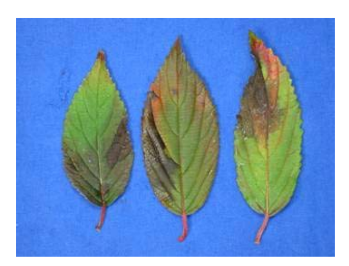
P. ramorum infested viburnum leaves, J. Parke, OSU