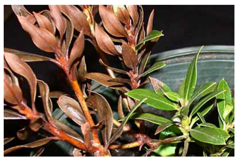
P. ramorum infested Kalmia stems and leaves, Oregon Department of Agriculture