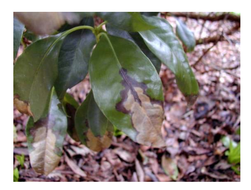
Kalmia leaves infested by P. ramorum, DEFRA, UK