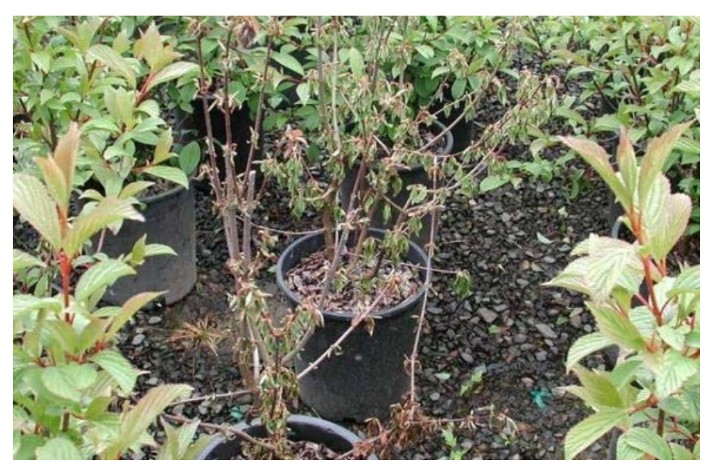
P. ramorum infested viburnum