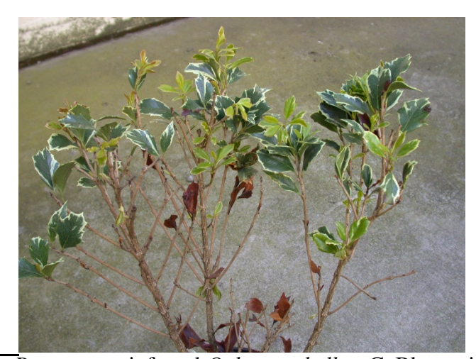
P. ramorum infested O. heterophyllus, C. Blomquist