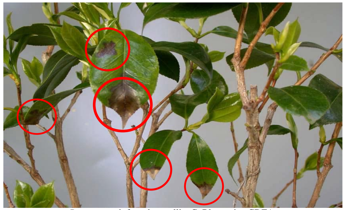
P. ramorum infected camellia, C. Blomquist, CDFA