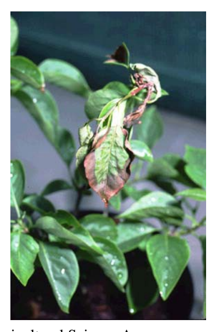
P. ramorum infested Lilac foliage, Scottish Agricultural Science Agency