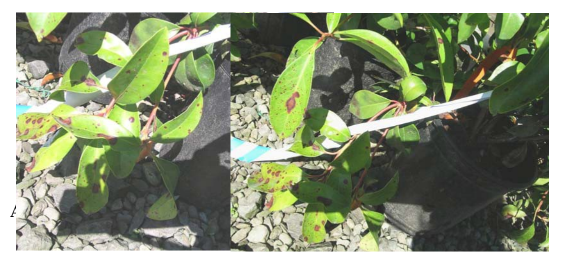
P. ramorum infested Kalmia foliage