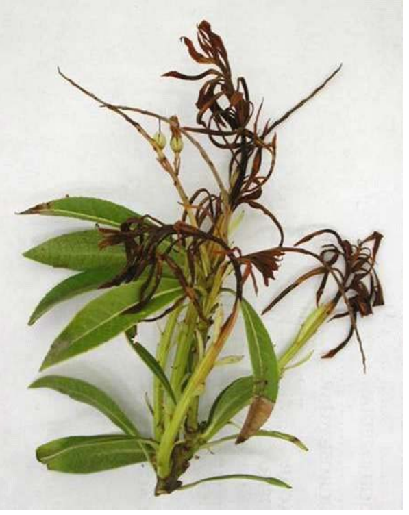
P. ramorum infected Pieris leaves, stems, flowers, N. Osterbauer, ODA