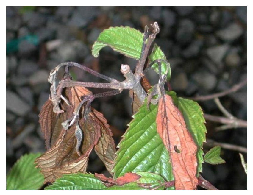
P. ramorum infested viburnum, Oregon Department of Agriculture