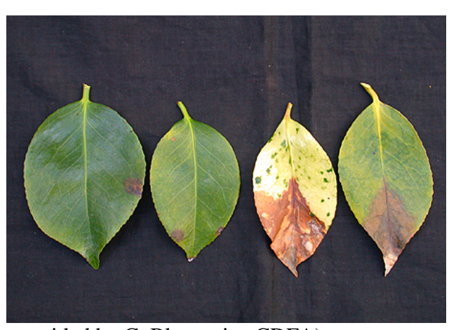
P. ramorum infected camellia leaves