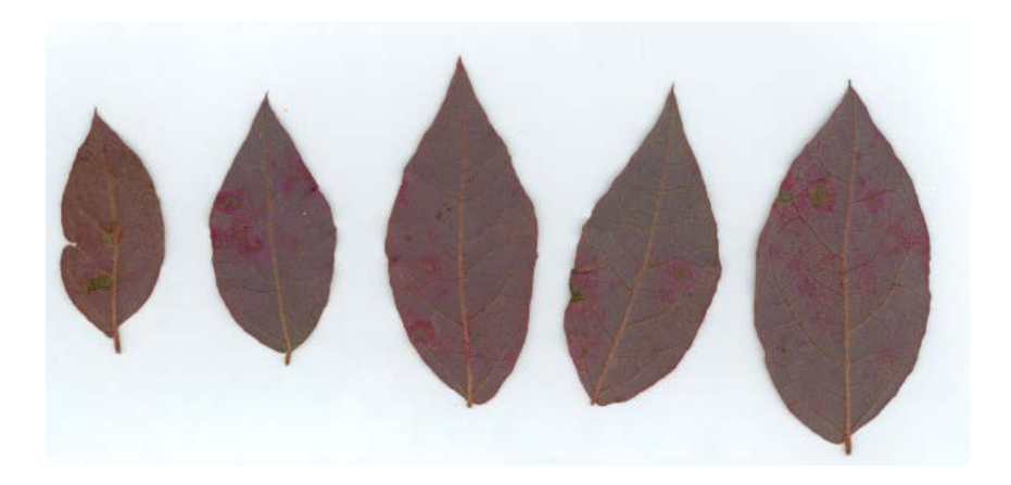
P. ramorum infested Loropetalum leaves