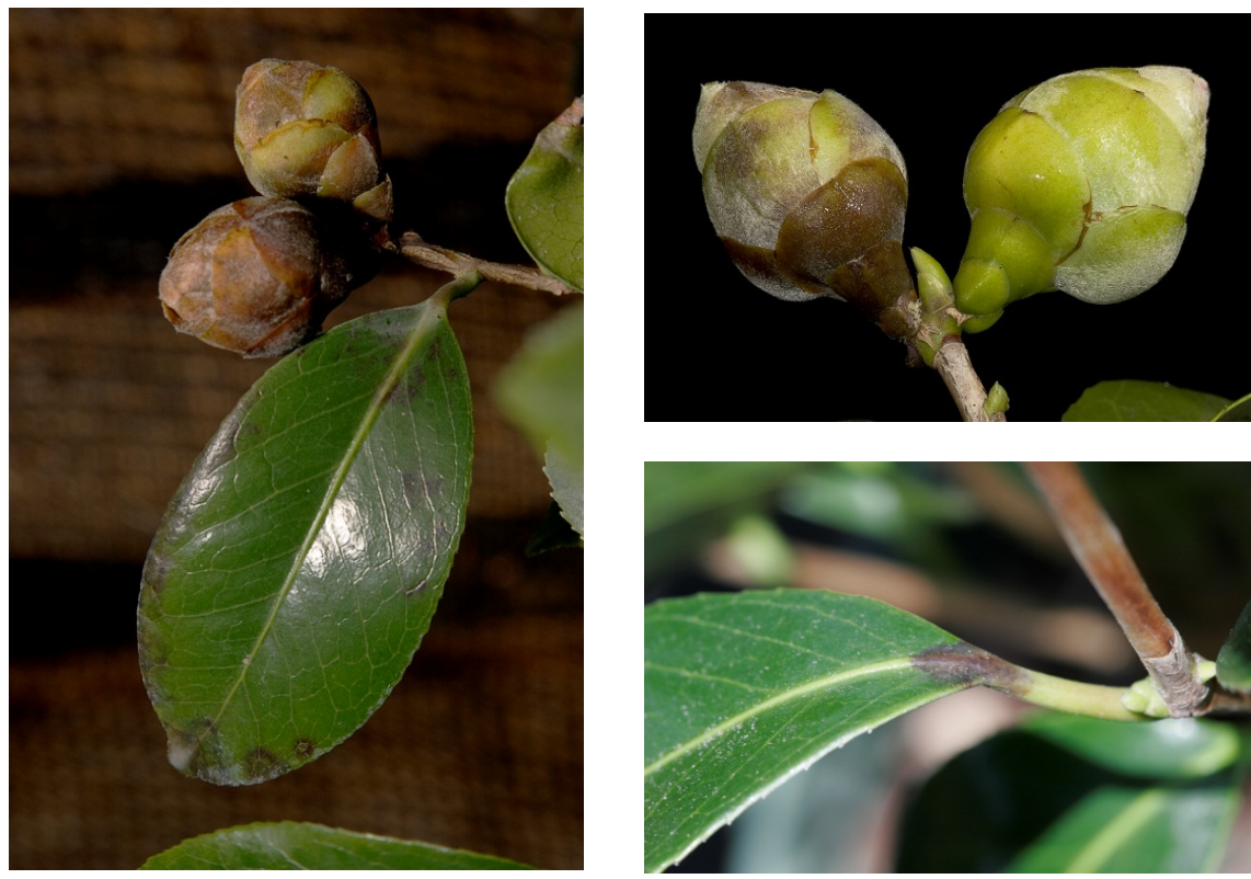
P. ramorum infected camellia leaf, flower buds and leaf petiole, S. Tjosvold

As with other hosts, many of the visual symptoms will occur where water tends to collect following irrigation, or on lower plant parts in areas which stay wet for longer periods of time.