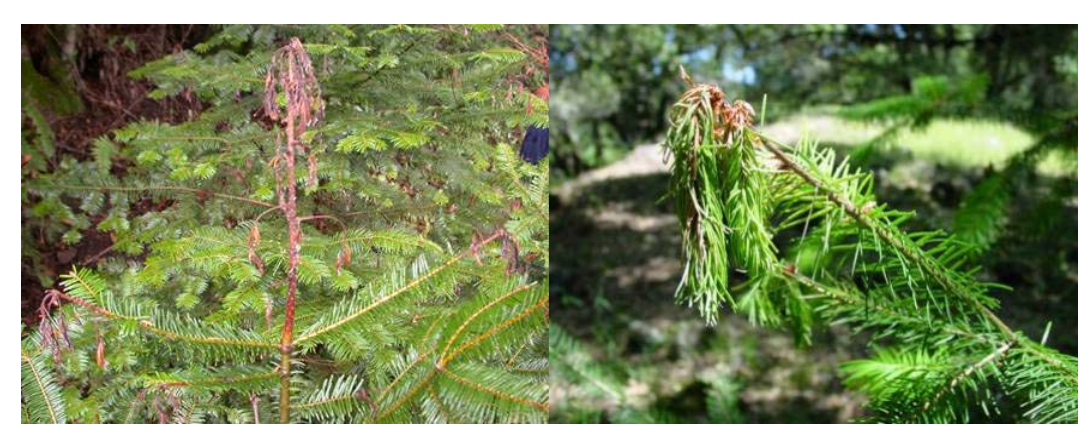
Grand Fir