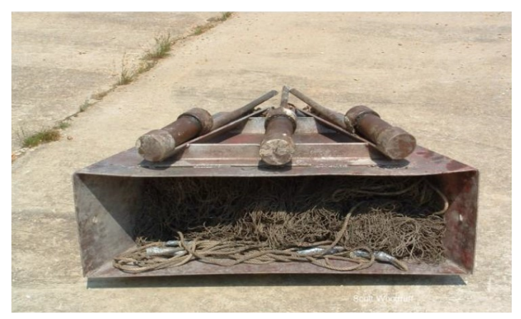
Figure 6. Portable rocket net system.