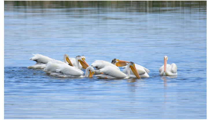
Figure 11. Foraging pelicans.