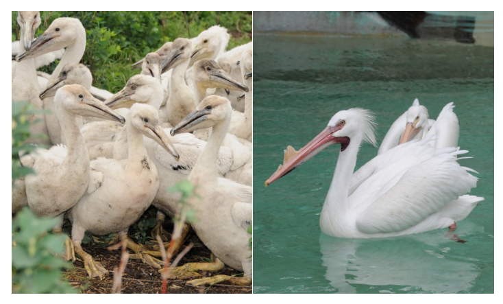
Figure 8. Young (left) and adult (breeding) American white pelicans