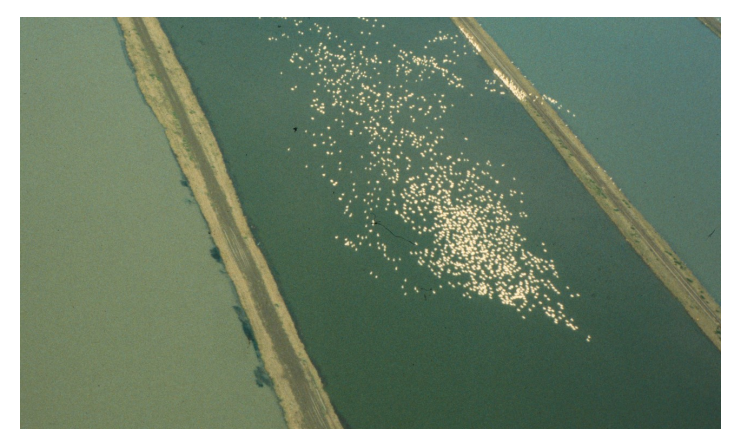
Figure 2. Pelicans on catfish farm.

example, assuming that pelicans foraging in a catfish pond ate only catfish averaging 10.2 inches, each bird would require 11 catfish to meet its energetic requirement of 2 pounds per day. This consumption rate translates into 2,750 catfish consumed per day by an average-sized flock of 250 pelicans. If these fish reached a harvestable size of 1.5 pounds and were valued at $0.70 per pound, catfish farmers could lose approximately $2,900 per day from pelican foraging. Actual depredation losses depend on pelican abundance at ponds, the size and number of catfish eaten, and the duration of foraging at catfish ponds.