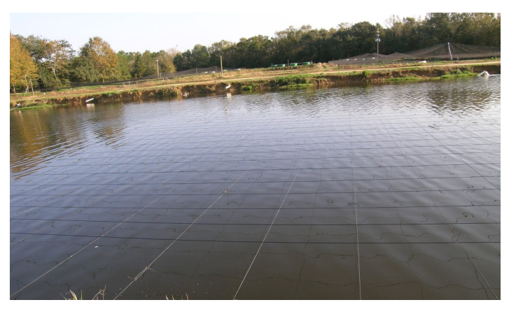
Figure 3. Example of grid wires at a fish farm.

All exclusion structures must be strong enough to prevent the weight of large birds and their activities from making the net sag to within feeding distance of the water. Construct all exclusion structures to allow use of fish maintenance equipment and, if necessary, to withstand wind and the accumulation of snow and ice. Non-rigid exclusion structures, such as suspended netting, may need lines, pulleys, and counterweights to facilitate lifting and lowering during adverse conditions or maintenance.