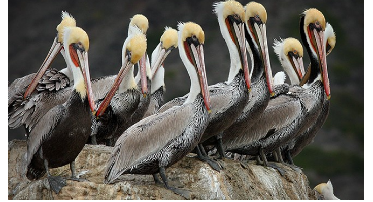
Figure 7. Brown pelican (Pelecanus occidentalis)

The breeding range of the American white pelican extends from south-central British Columbia, Alberta, Saskatchewan, Manitoba, and southwestern Ontario southward to Wisconsin, Minnesota, North Dakota, South Dakota, Montana, Wyoming, Colorado, Utah, Nevada, California, and Oregon (Figure 9). One viable American white pelican colony of approximately 400 exists near Corpus Christi, Texas in the Laguna Madre.