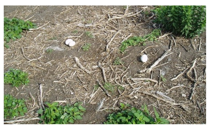
Figure 10. Typical shallow depression used by American white pelicans for nesting.

A nest count in 2013 found approximately 100,000 nests at more than 55 colonies in the U.S. and Canada. Therefore, a conservative estimate of the number of adult (breeding age) American white pelicans is 200,000 birds. The numbers of both adults and colonies appear to be increasing. American white pelicans can be common to unusual throughout their range. They occur in large numbers in or near their breeding colonies (200 to 30,000