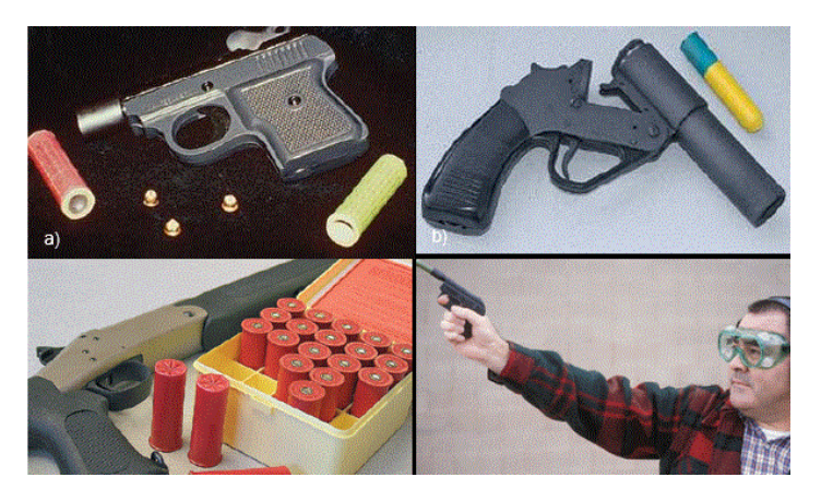
Figure 4. Pyrotechnics are used to disperse foraging pelicans.

As with all firearms, make sure it is safe to discharge a firearm in a particular area. Because American white pelicans are large birds, accuracy is essential to ensure immediate death. Dispatch wounded birds quickly. Use a shotgun, 12-gauge or larger, with T-shot or larger