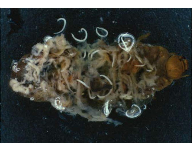
A dissected Japanese beetle larva showing later stages of the Heterorhabditis bacteriophora nematode

Nematodes—Insect-eating nematodes—microscopic parasitic roundworms—actively seek out grubs in the soil. These nematodes have a mutualistic symbiotic relationship with a single species of bacteria. Upon penetrating a grub, the nematode inoculates it with the bacteria. The bacteria reproduce quickly, feeding on the grub tissue. The nematode then feeds on this bacteria and progresses through its own life cycle, reproducing and ultimately killing the grub.