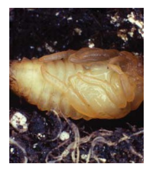
Japanese beetle pupa

slightly smaller than the females. You are most likely to see the adults from late spring through midsummer.