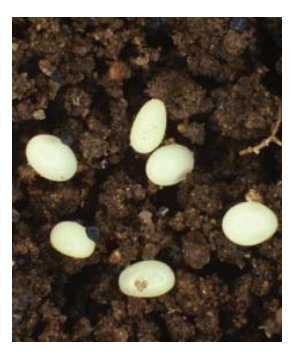
A typical cluster of Japanese beetle eggs

Both as adults and as grubs (the larval stage), Japanese beetles are destructive plant pests. Adults feed on the foliage and fruits of several hundred species of fruit trees, ornamental trees, shrubs, vines, and field and vegetable crops. Adults leave behind skeletonized leaves and large, irregular holes in leaves. The grubs develop in the soil, feeding on the roots of various plants and grasses and often destroying turf in lawns, parks, golf courses, and pastures.