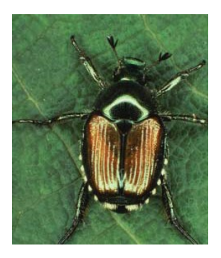
The Japanese beetle adult an attractive pest