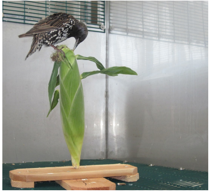
Figure 4. Starling perched on sweet corn during a repellent study with captive birds.

A flock of 1,000 starlings using a CAFO for 60 days during winter will eat about 1.5 tons of cattle feed, representing a loss of $200 to $400 per 1,000 starlings. About 250,000 starlings that were using a Midwestern feedlot increased the cost of feeding a ration of steam-flaked corn by $43 per heifer over a 47-day period between mid-January and March. Costs in lost production (i.e., livestock weight gained per unit feed consumed) over this period was $1.00 per animal.