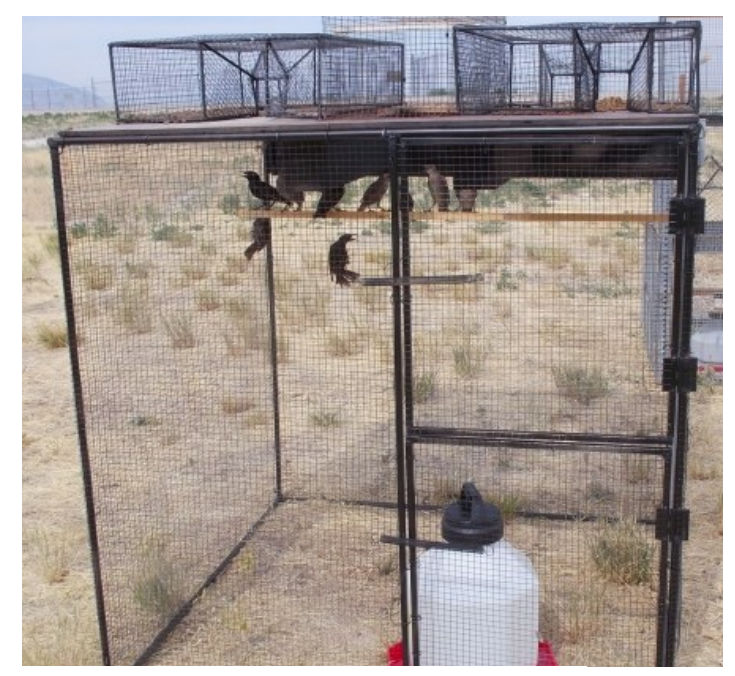
Figure 12. Cage trap used to capture starlings.

Cage traps (Figure 12) for starlings should be at least 5 to 6 feet tall to allow the operator ease-of-entry and freedom