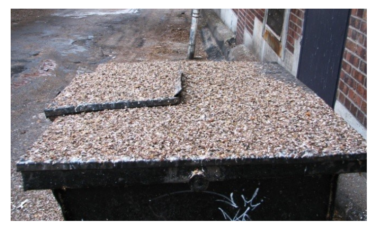
Figure 8. Starling fecal material from a roost above an alleyway in an urban center.

Although H. capsulatum is associated with soils, it can be found growing inside and around buildings. Thus, starling roosts at industrial sites, manufacturing facilities and abandoned buildings potentially contain the fungus. Commonly used roost sites inside of buildings include stairwells, window ledges, pillars, pipes and beams.