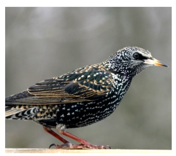
Figure 1. Female European starling in winter plumage.

Research Wildlife Biologist (retired) USDA-APHIS-Wildlife Services National Wildlife Research Center Fort Collins, Colorado