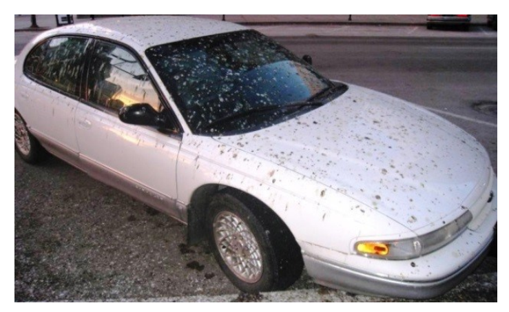
Figure 6. Vehicle parked near an urban starling roost.

Laboratory studies show that fecal shedding from starling to starling, starling to cattle, and cattle to starling can transfer the STEC pathotype, E. coli 0157. Cattle to starling transmission occurs rapidly, taking less than a day. Field studies have provided circumstantial support for starlings