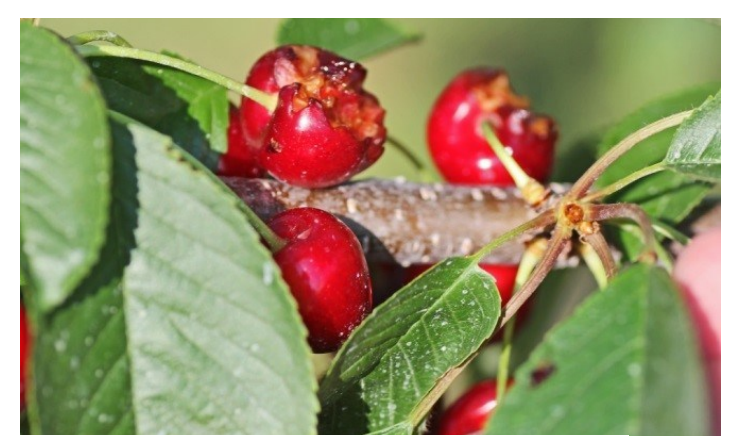
Figure 2. Bird damage to sweet cherries in Michigan.

Other results from the 2012 survey of producers indicated $51 million in damages to sweet cherries and $33 million to blueberries. Total bird damage for the five types of fruit crops covered in the 2012 survey (blueberries, wine grapes, apples, sweet cherries and tart cherries) was estimated at $189 million. Starlings were ranked either first or second among the bird species believed responsible for damaging the five crop types in the survey.