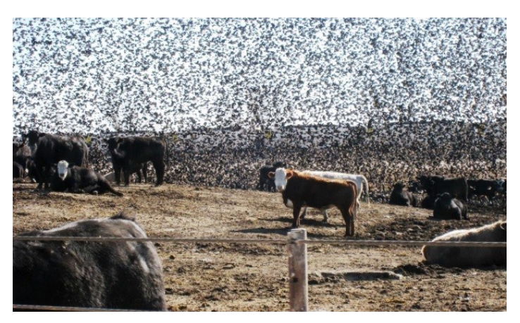
Figure 18. Starlings at a cattle feedlot.

Starlings can eat remarkable amounts of fruit because of their inefficiency in digesting high-carbohydrate foods. Caged starlings allowed to feed at liberty on blueberries ate 9 ounces per bird per day, nearly 3 times their bodyweight. Similarly, starlings are quite voracious with grapes, eating nearly 14 ounces per bird per day.