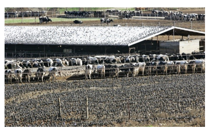
Figure 5. Starlings resting and feeding at a dairy farm.

Lastly, urban and suburban starlings commonly use building exhaust vents as nest sites. Nests can clog vents and create unsafe venting conditions.