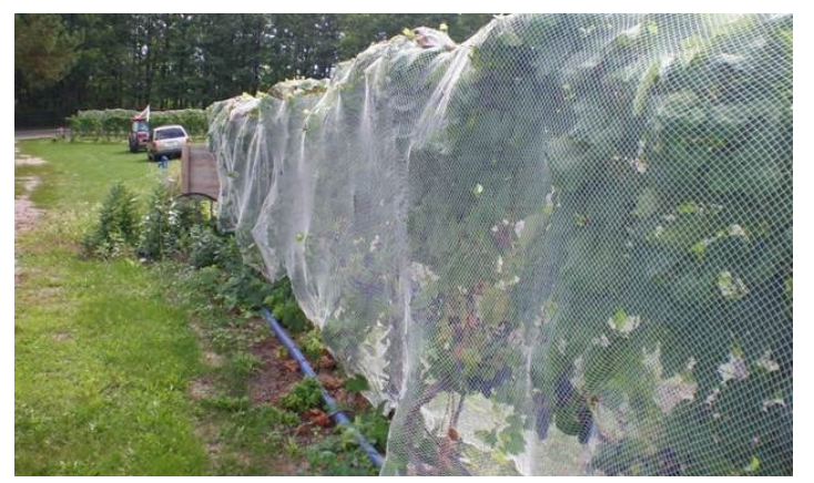
Figure 10. Netting is effective for protecting high-value crops, such as wine grapes.

Fruit damage begins as soon as fruits start to turn color, sometimes as early as June. Varieties of fruit that ripen earlier tend to receive more damage and need more protection because of lower availability of natural food sources early in the growing season.