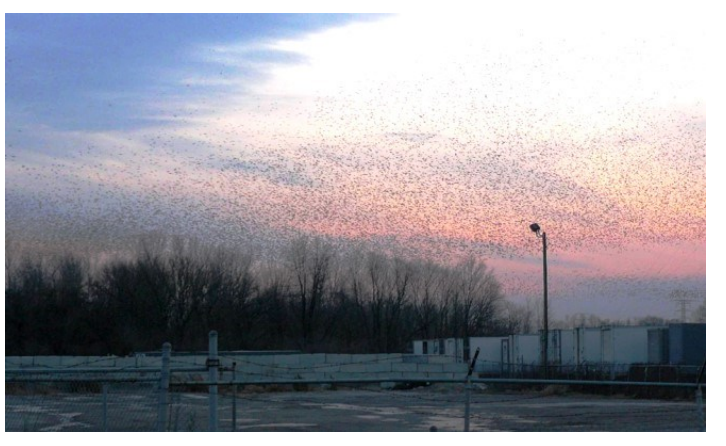
Figure 17. Starlings entering a woodlot roost near Indianapolis, IN.

Urban roosts typically contain 10,000 to 30,000 starlings. Morning departures from urban roosts are difficult to track because starlings leave at first light and break into smaller flocks often going in several directions. Urban starlings use surrounding industrial parks, recreational areas, granaries, landfills, and suburban areas throughout the day. Very few starlings remain within the urban area proper. Outlying agricultural habitats within 25 miles of an urban roost may be used. Upon returning to an urban roost, starlings stage in secluded industrial areas and commercial areas within a few miles of the roost site.