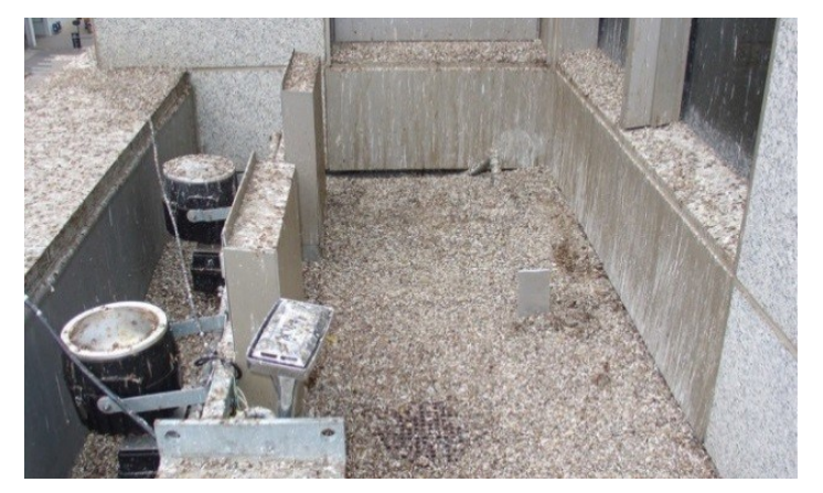
Figure 7. Starling roost located on a skyscraper.