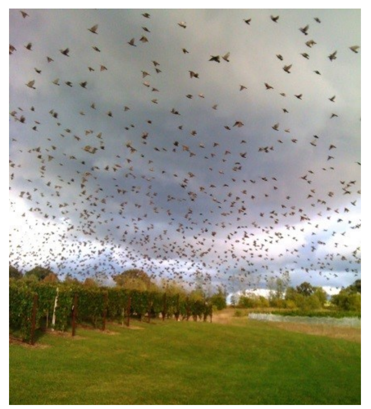
Figure 3. Starlings entering a vineyard.

Starlings gather at concentrated animal feeding operations (CAFOs) during late fall and winter. Flocks are much larger than those encountered in late summer and are harder to disperse because of a lack of alternative foods. Starlings prefer facilities with open feeder systems which provide easy access to livestock rations (Figure 5).