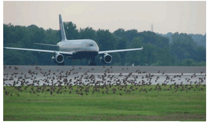
Figure 9. A flock of European starlings in the path of a landing jet.

Residents of cities and towns complain about the noise, smell and unsightliness of starling roosts. Most starling roosts in residential areas are temporary aggregations, provided that the roosts do not occur in dense stands of evergreens. If left alone, the roost may last a couple of weeks. Harassing starlings with auditory stimuli as they enter the roost can cause the roost to break up earlier. Temporary roosting sites in cities and towns often are used by several other bird species, including blackbirds, American robins, purple martins, and mourning doves (Zenaida macroura).