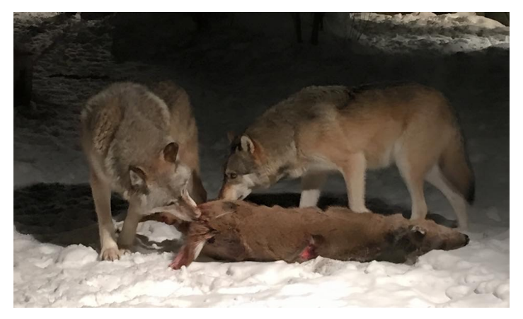
Figure 5. Gray wolves feed on a donated deer carcass at the International Wolf Center in Minnesota.

containers to prevent noxious odors. Carcasses must be disposed at permitted landfills capable of handling solid waste.