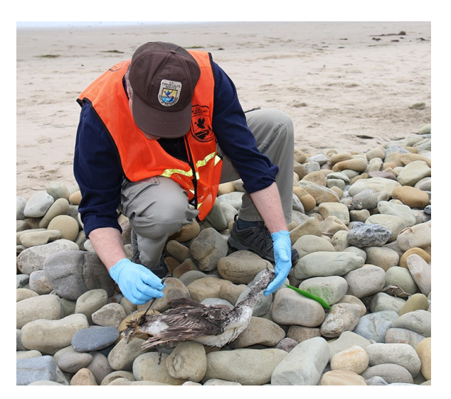
Figure 1. A U.S. Fish and Wildlife Service biologist inspects and removes a dead bird following an oil spill. Proper disposal of animal carcasses can help ensure a safe environment for people and wildlife.