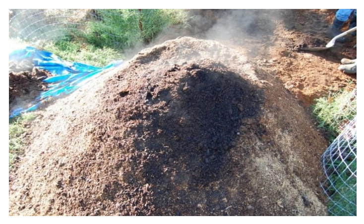
Figure 4. Compost pile (notice steam caused by the heat being generated).

During composting activities, it is important to periodically check the pile to ensure that cracks have not formed in the bulking material (e.g., wood chips, leaves, saw dust) as the carcass continues to breakdown. These cracks become sources for odors and may attract scavenging animals. This is especially true during the first week when carcasses discharge large amounts of fluid, causing the body of the carcass to collapse and fissures to form along the top edges of the compost pile. Any and all cracks may be repaired simply by using a hand rake or other tool to smooth over the disturbed areas. In rare cases, additional bulking material may be needed to effectively close openings. With the exception of occasional pile maintenance, carcass composting is a relatively simple alternative to conventional disposal practices.