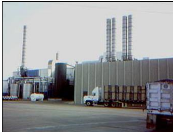
Figure 8. Delivery to a Rendering Facility

Rendering Facility Evaluation – The facility must be constructed and operated in accordance with applicable regulations and the conditions of its operating permit. It is important for planners to realize that not all rendering plants have the capacity or capability to accept infected carcasses.