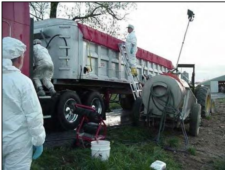
Figure 10. Vehicle Cleaning and Disinfection Operations

Critical steps used during recent U.S. animal disease outbreaks are also included.