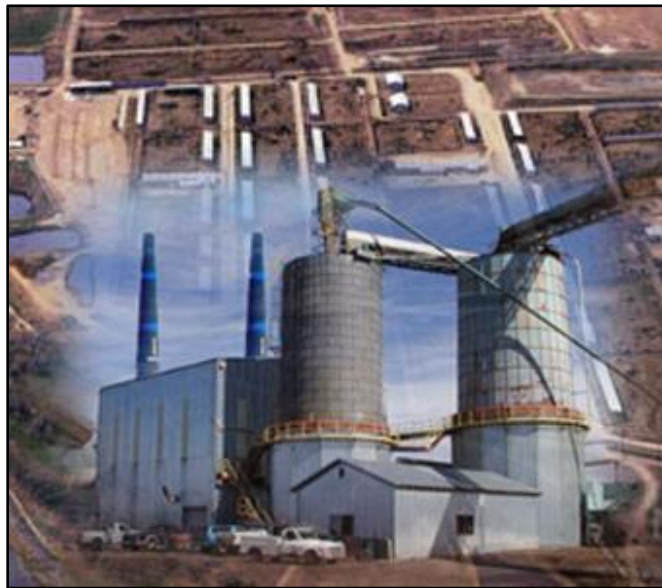
Figure 6. Rendering Facility