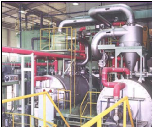
Figure 2. Rendering Facility