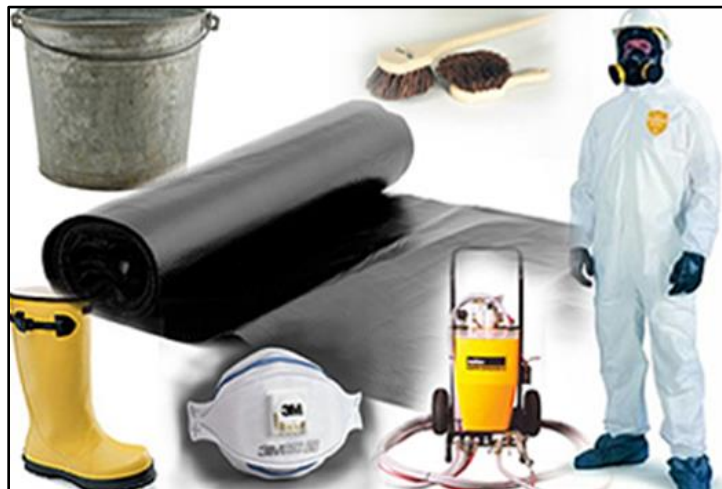
Figure 9. Example Supplies Needed for Cleaning and Disinfection