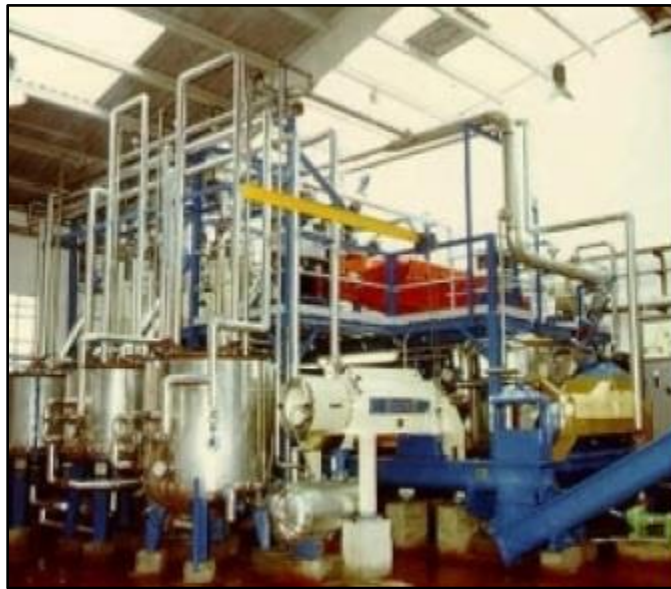
Figure 1. Modern Rendering Facility