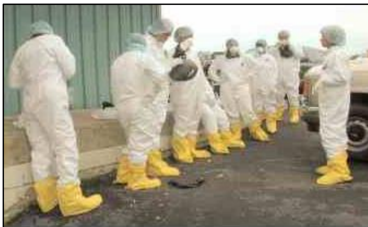
Figure 7. Briefing the Carcass Management Team