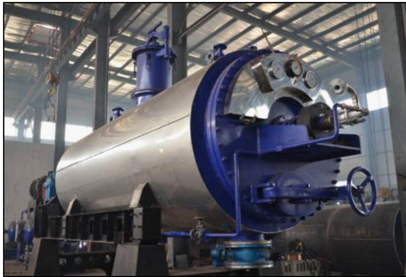
Figure 4. Cooking Cylinder

Batch rendering involves the transfer of the heated product to another cooking cylinder before completion of the cooking process. A batch cooker is like a large pressure cooker in many kitchens. The heating process normally takes 2-3 hours. In terms of loading, some plants discharge raw materials to the batch cooker when the batch maximum temperature is reached; others use a holding time of up to 30 minutes. After the heating process, the tallow is drained and the solids are emptied.