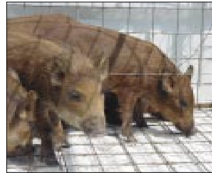
Figure 4— Cage traps are effective in trapping wild hogs, especially when food supplies are limited, as in winter.

pigs are moved, they should be blood-tested by a veterinarian to certify that they are free from disease.