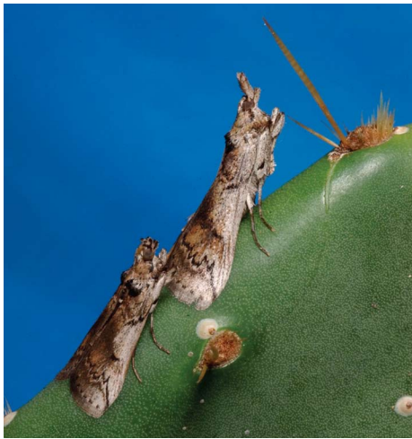
Adult cactus moths (male on the left; female on the right).

Once hailed as a hero in Australia when it was introduced to control unwanted populations of exotic prickly pear cacti, the cactus moth has recently established itself as an American pest. Now it threatens native landscapes and agriculture in the Southern United States and Mexico.