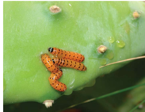
Cactus moth larvae.

1. Check for Larvae. Adult moths are difficult to identify without dissection. So the best detection strategy is to look for the cactus moth's distinctive larvae, or caterpillars. Mature larvae grow to a length of about 1.5 cm (0.5 in), and are reddish-orange with blackish spots forming transverse bands. In larvae in their final (sixth) instar, these transverse bands are nearly always divided into spots.