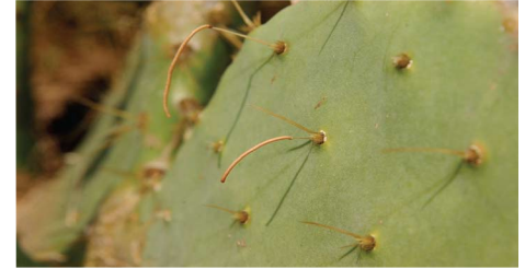
Cactus moth egg stick.

2. Check for Egg Sticks. Between late February and November, adult cactus moths lay chains of eggs called egg sticks that resemble the naturally occurring spines on prickly pear pads. The egg sticks are initially cream colored but darken to brown, and later almost black, shortly before the larvae emerge. The egg sticks look like prickly pear spines but are curved. An egg stick with about 70 eggs is approximately 2.4 cm (nearly 1 inch) long. Other native prickly pear-feeding moth species in the genus Melitara also lay their eggs in sticks. Their egg sticks cannot reliably be distinguished from those of the cactus moth.