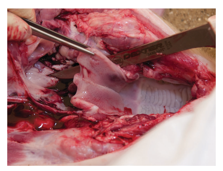
Tonsils are another tissue that can be tested for ASF. Spleen is the preferred specimen when possible.