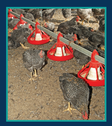
Allowing your flock to come in contact with wild birds could put it at risk for infectious poultry diseases.

Complete the self-assessment of biosecurity practices available at uspoultry.org/ programs/poultry-health/ biosecurity (click on "USDA Biosecurity Self-Assessment"). The U.S. Department of Agriculture (USDA) partnered with States and industry to develop this assessment as an aid for all commercial poultry owners in understanding and putting in place enhanced biosecurity measures. You can also contact your industry organization for more resources.