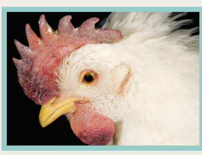
Swelling of the tissue around the eyes and purple discoloration of the comb and wattles