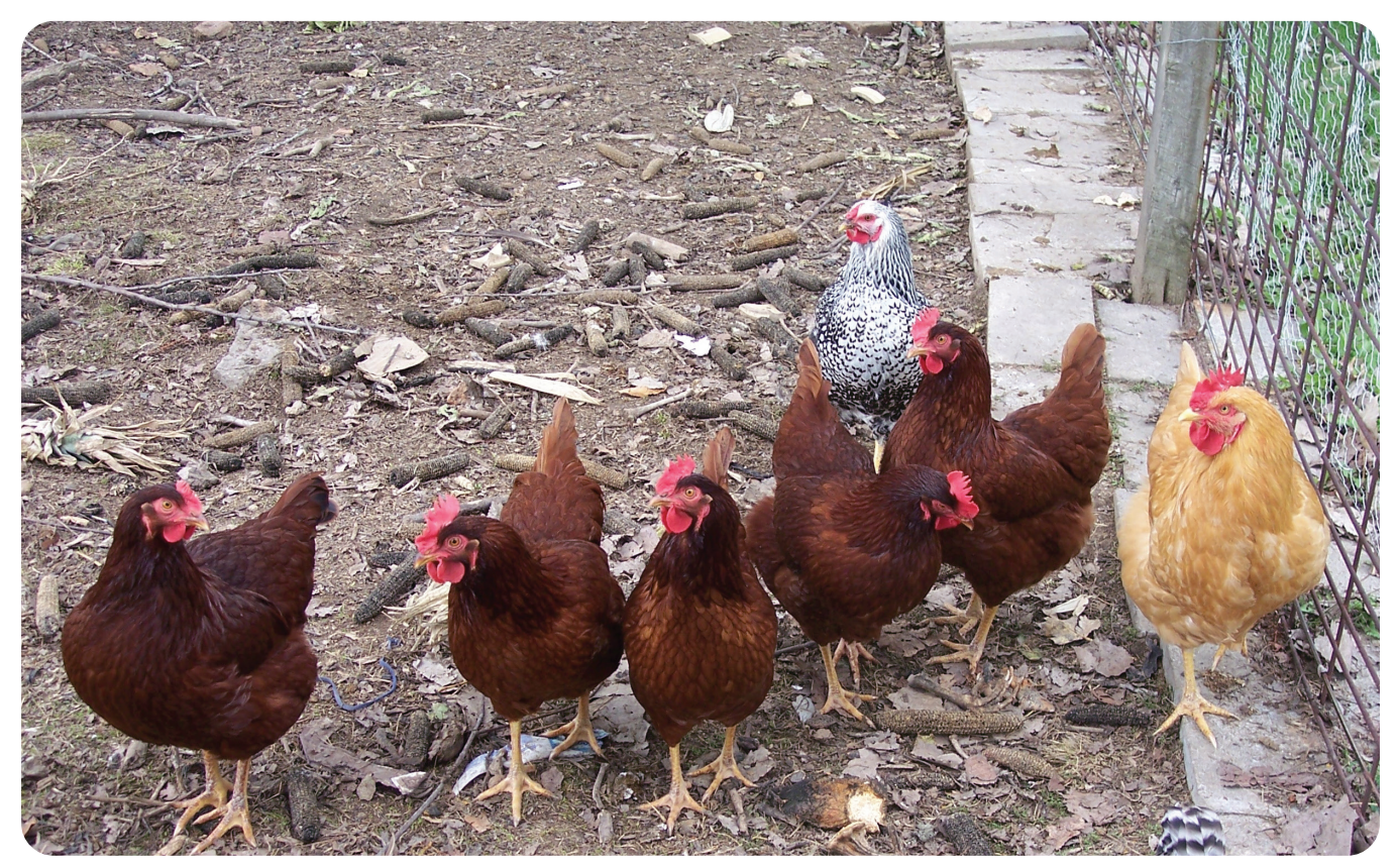
Fencing your bird area can help keep your flock safe from predators and from contact with other birds that could spread disease.

It takes just one contact with this virus to sicken or kill your birds. In a single day, the avian influenza virus can multiply and infect every bird on your premises.