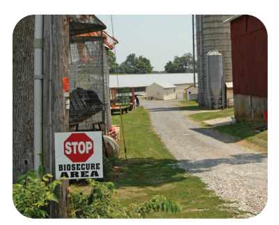
Biosecurity signage on a farm

Everyone who owns or works with poultry—whether you're part of a large commercial operation or raise birds as a hobby—needs to know the right steps to keep avian influenza from entering the premises. Making biosecurity an "every day, every time" practice is the best way to protect your birds. Even if you're