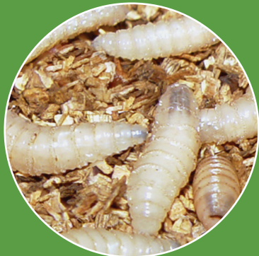
Magnified mature larvae