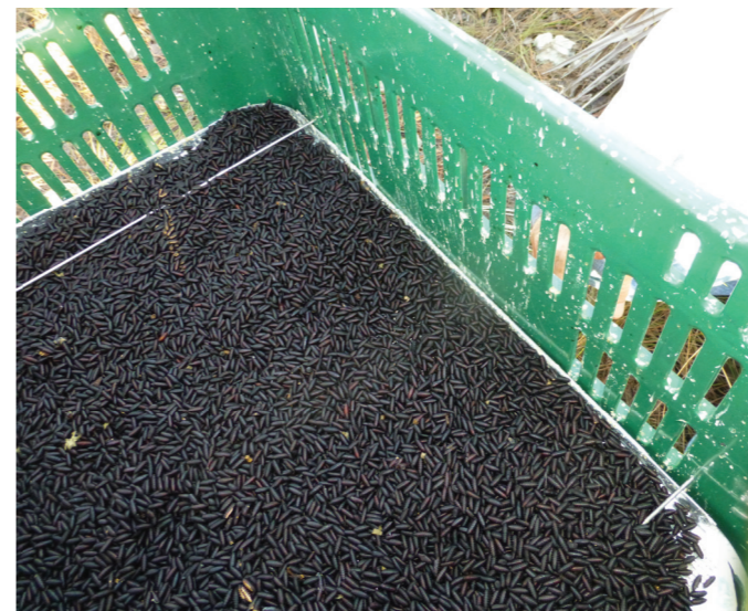
Sterilized NWS pupae released in infested area

Another incursion into the United States could cost millions of dollars from livestock losses, trade embargoes, and eradication work. Pets, livestock, wildlife, and even humans may suffer and die from screwworm myiasis.