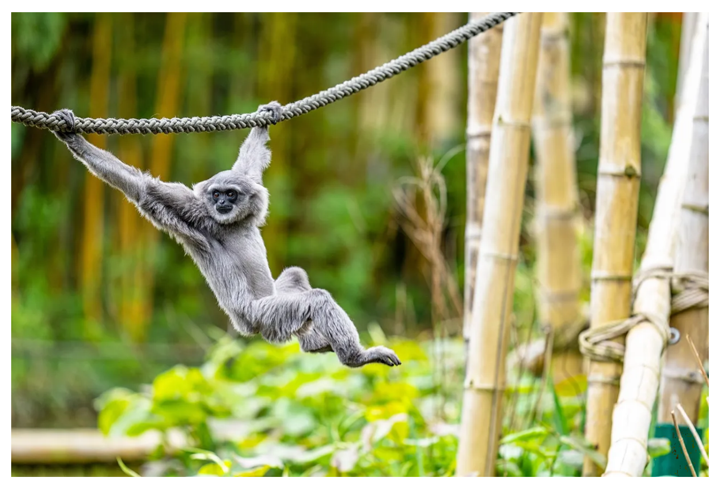
Other Animal Care Documents