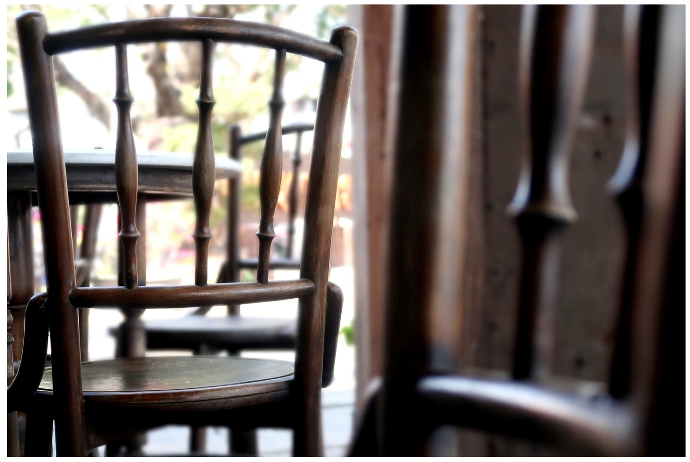
Frequently Asked Questions

Get answers to questions about specific topics, such as filing a Lacey Act declaration, revising a declaration, disclaiming products that are excluded from the requirements, Phase VII implementation, and more.