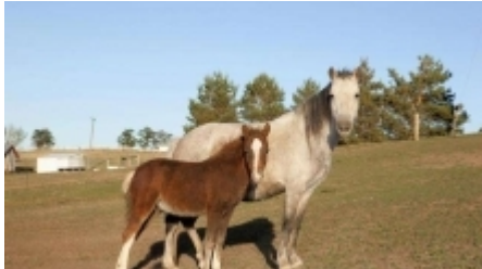
Federally Approved Livestock Markets Dashboard