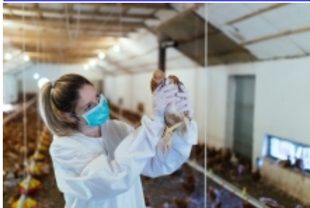
HPAI Wild Bird Dashboard