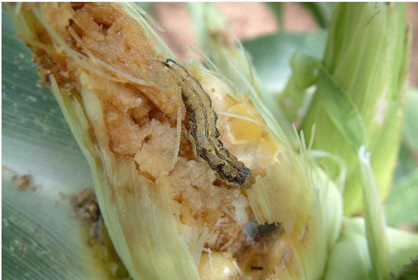
Oriental Fruit Fly