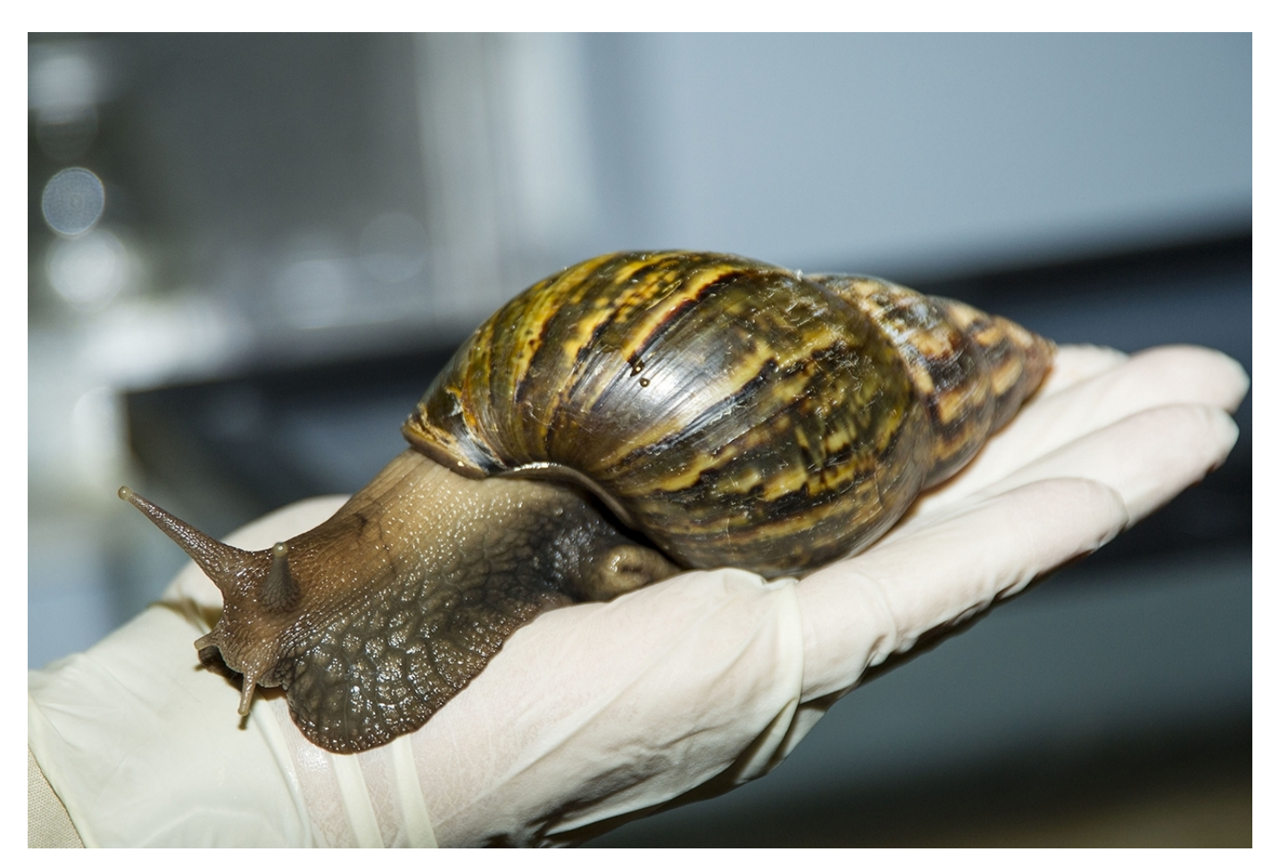
Imported Fire Ants