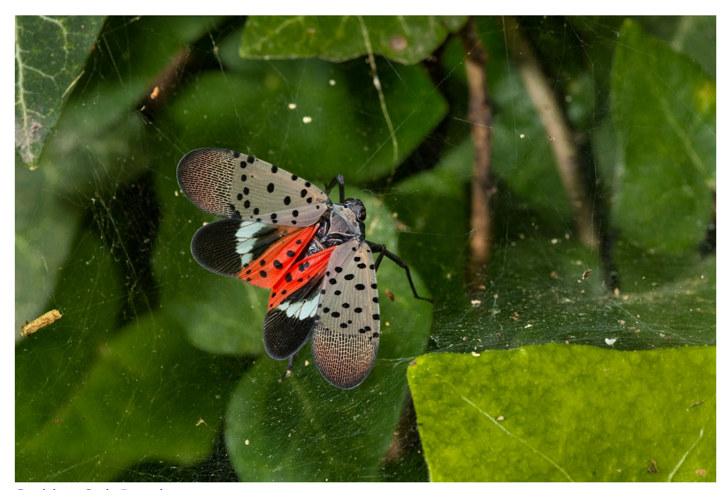
Sudden Oak Death