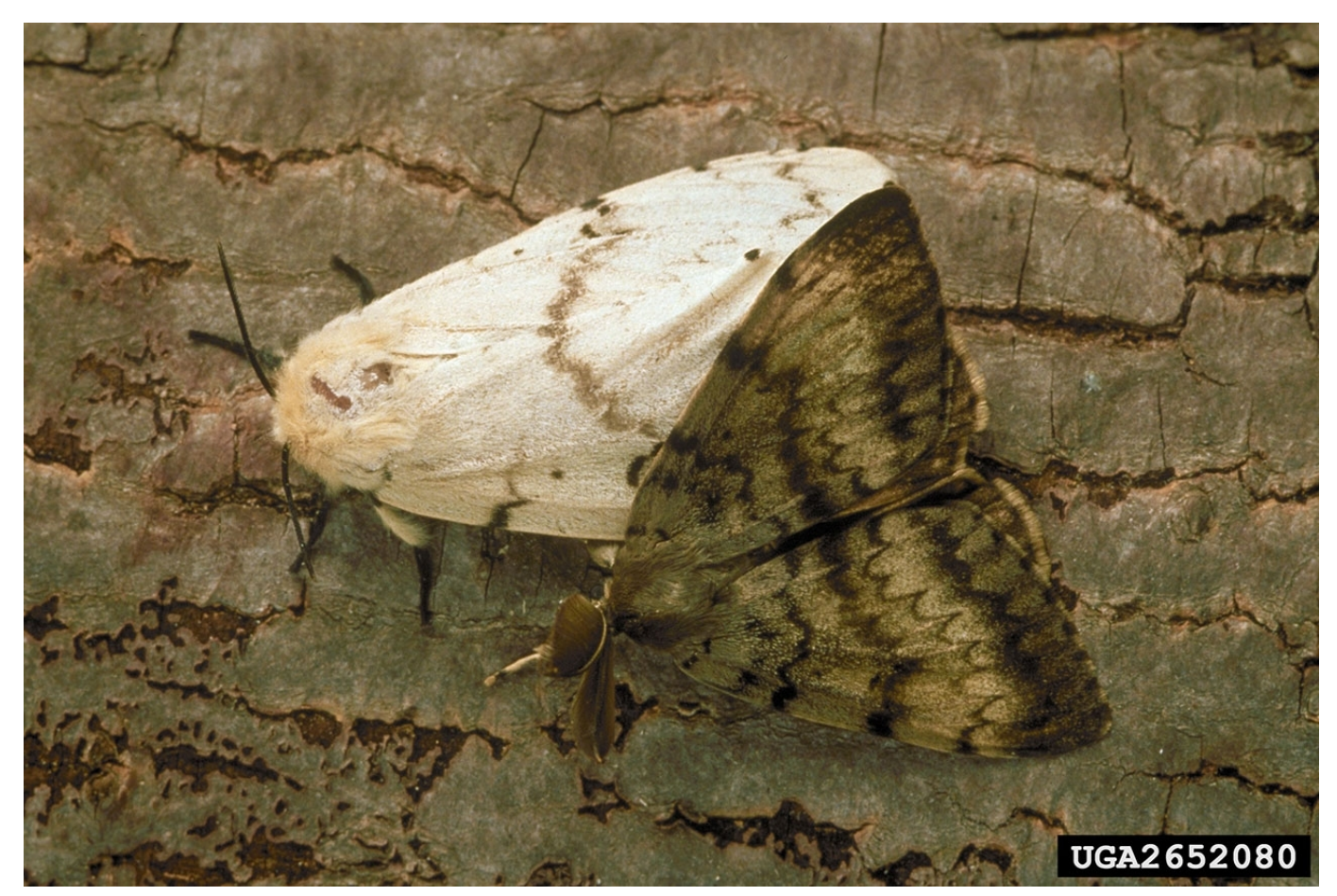
Giant African Snail