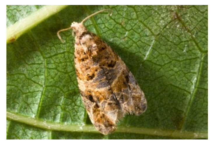
Flighted Spongy Moth Complex

Attacks: North American tree and shrub species