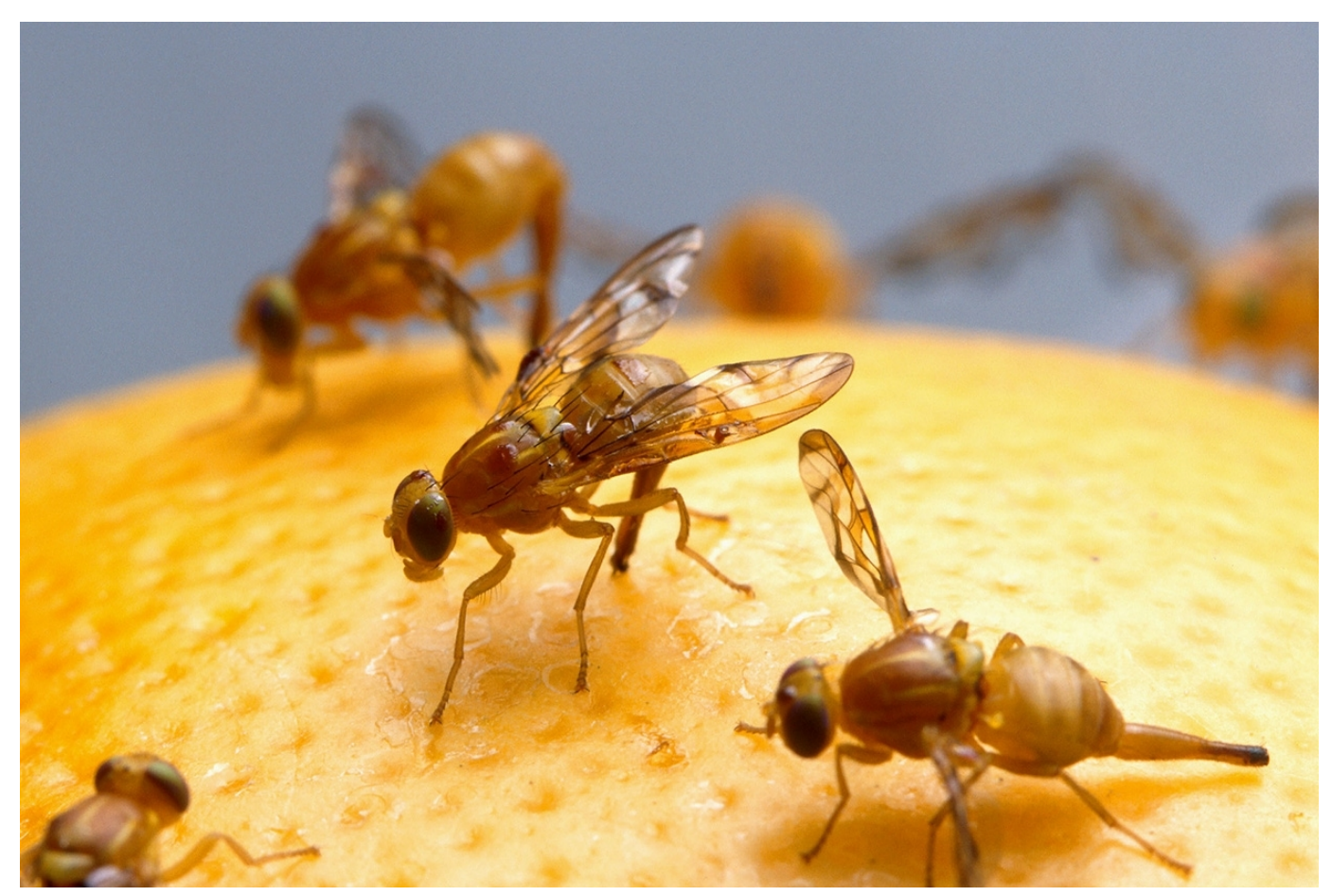
Old World Bollworm