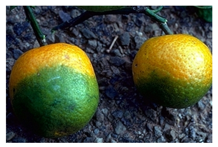
Coconut Rhinoceros Beetle

Attacks: palm trees, including coconut, date, and oil palms