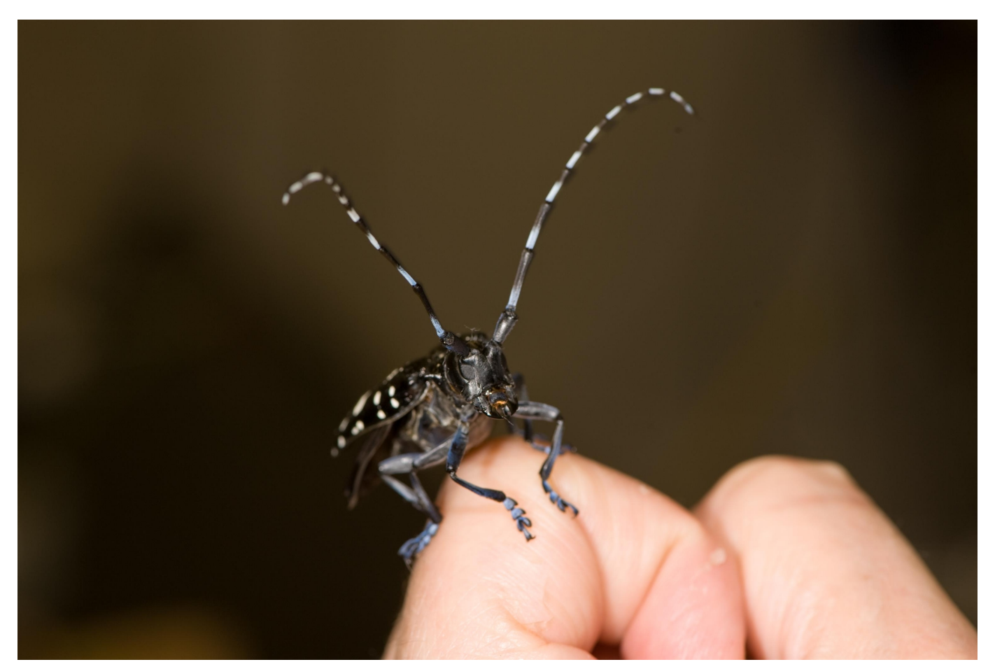
Citrus Greening and Asian Citrus Psyllid