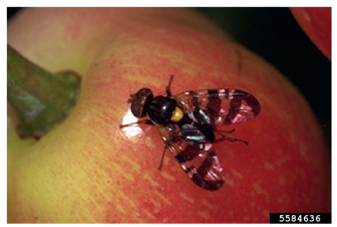
European Grapevine Moth