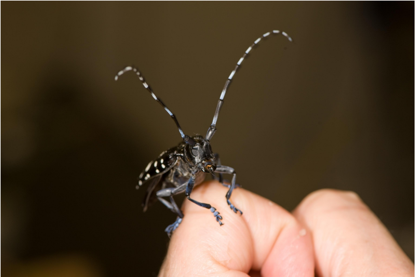
Citrus Greening and Asian Citrus Psyllid