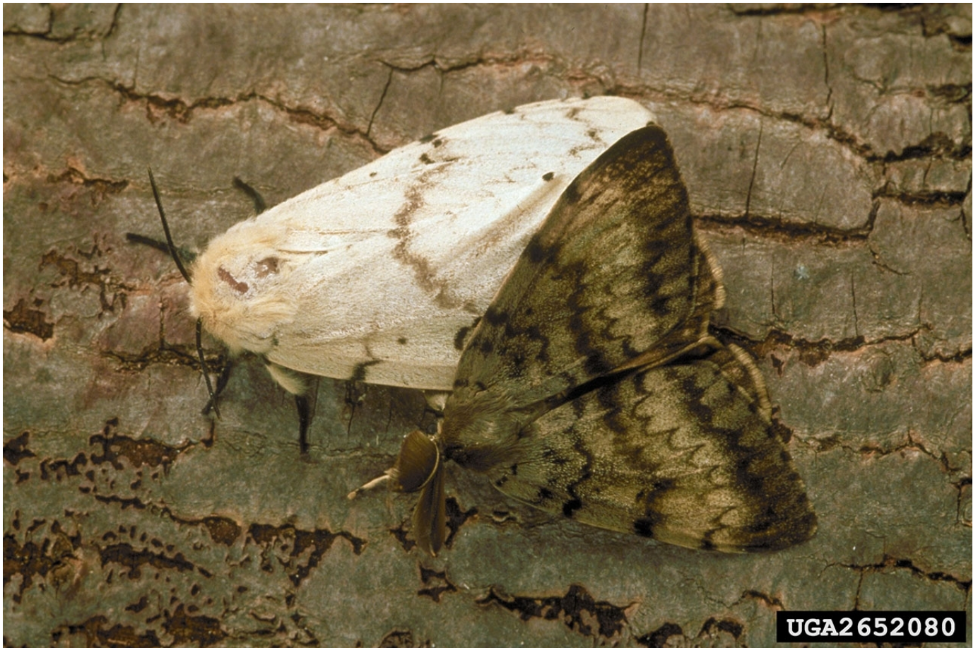
Giant African Snail