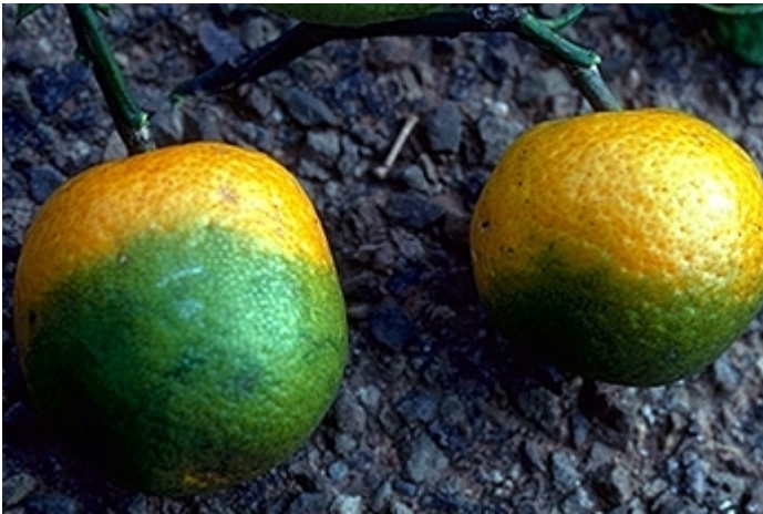
Coconut Rhinoceros Beetle

Attacks: palm trees, including coconut, date, and oil palms