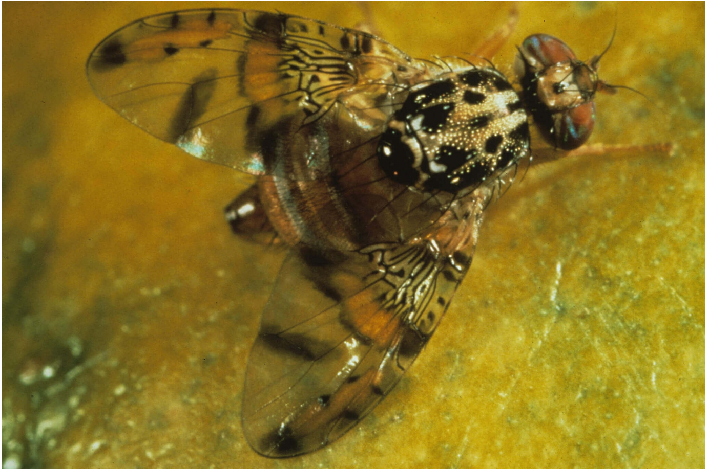
Mexican Fruit Fly

Attacks: fruits, particularly citrus and mango