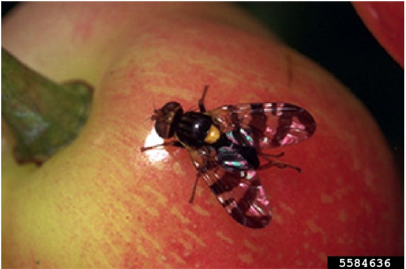
European Grapevine Moth