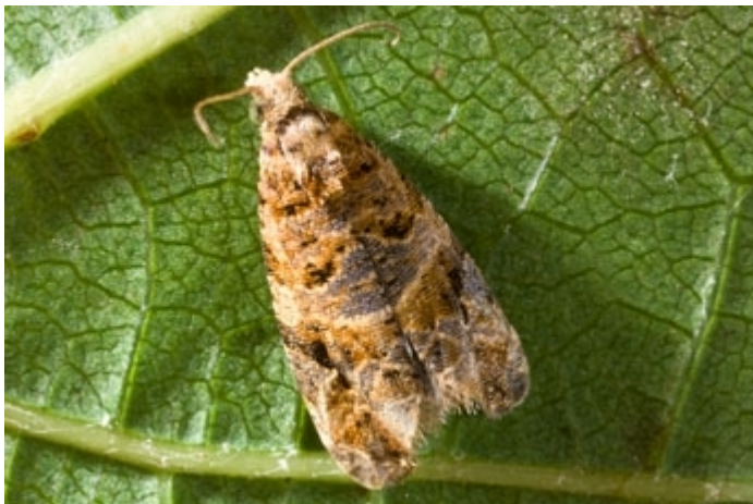
Flighted Spongy Moth Complex

Attacks: North American tree and shrub species