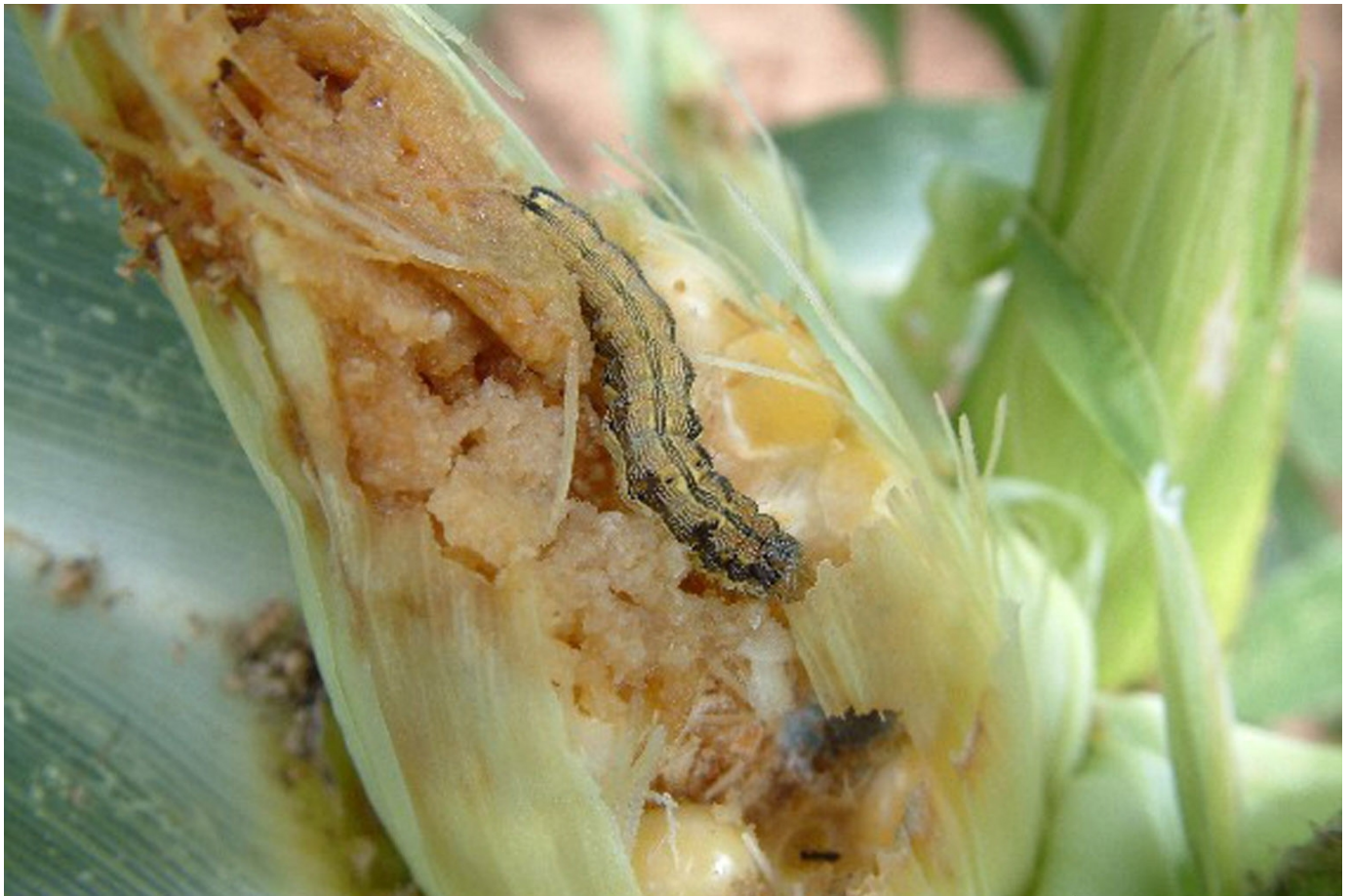
Oriental Fruit Fly