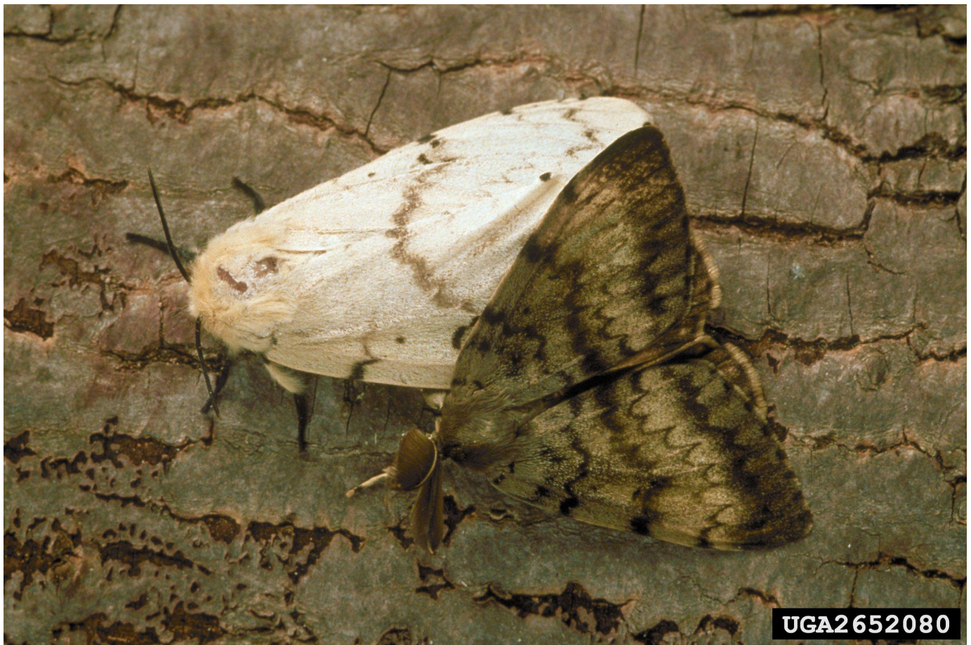
Giant African Snail