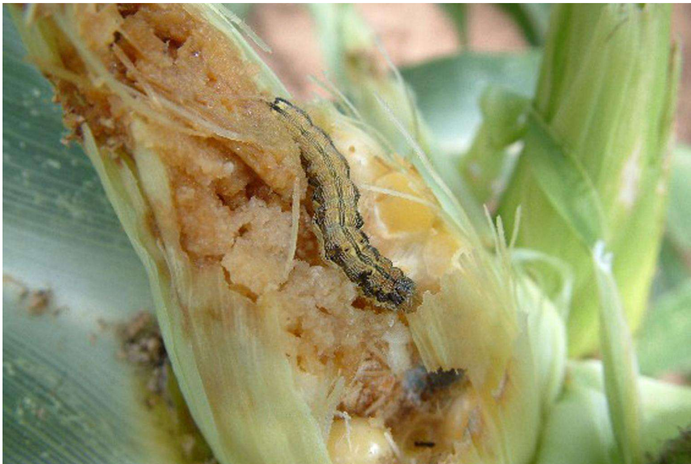
Oriental Fruit Fly