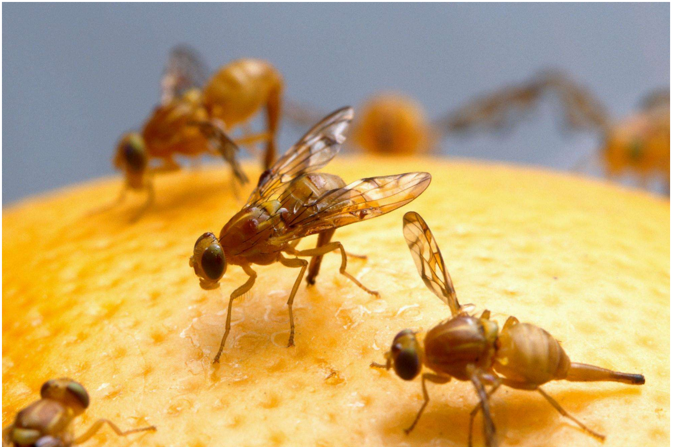
Oriental Fruit Fly