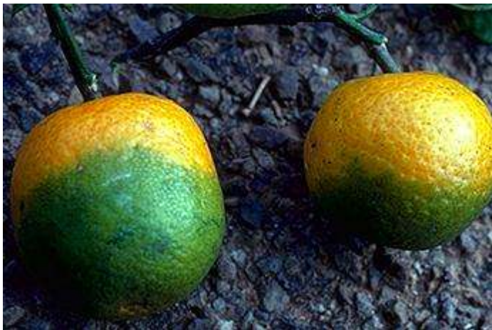
Coconut Rhinoceros Beetle

Attacks: palm trees, including coconut, date, and oil palms