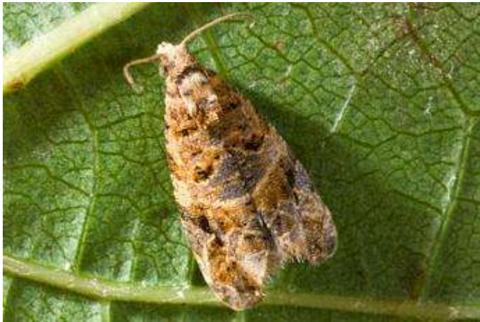
Flighted Spongy Moth Complex

Attacks: North American tree and shrub species