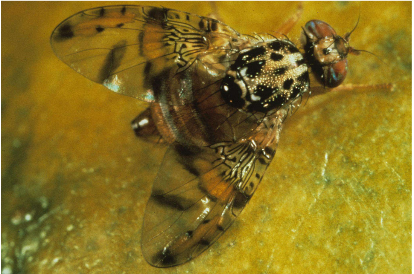
Mexican Fruit Fly

Attacks: fruits, particularly citrus and mango