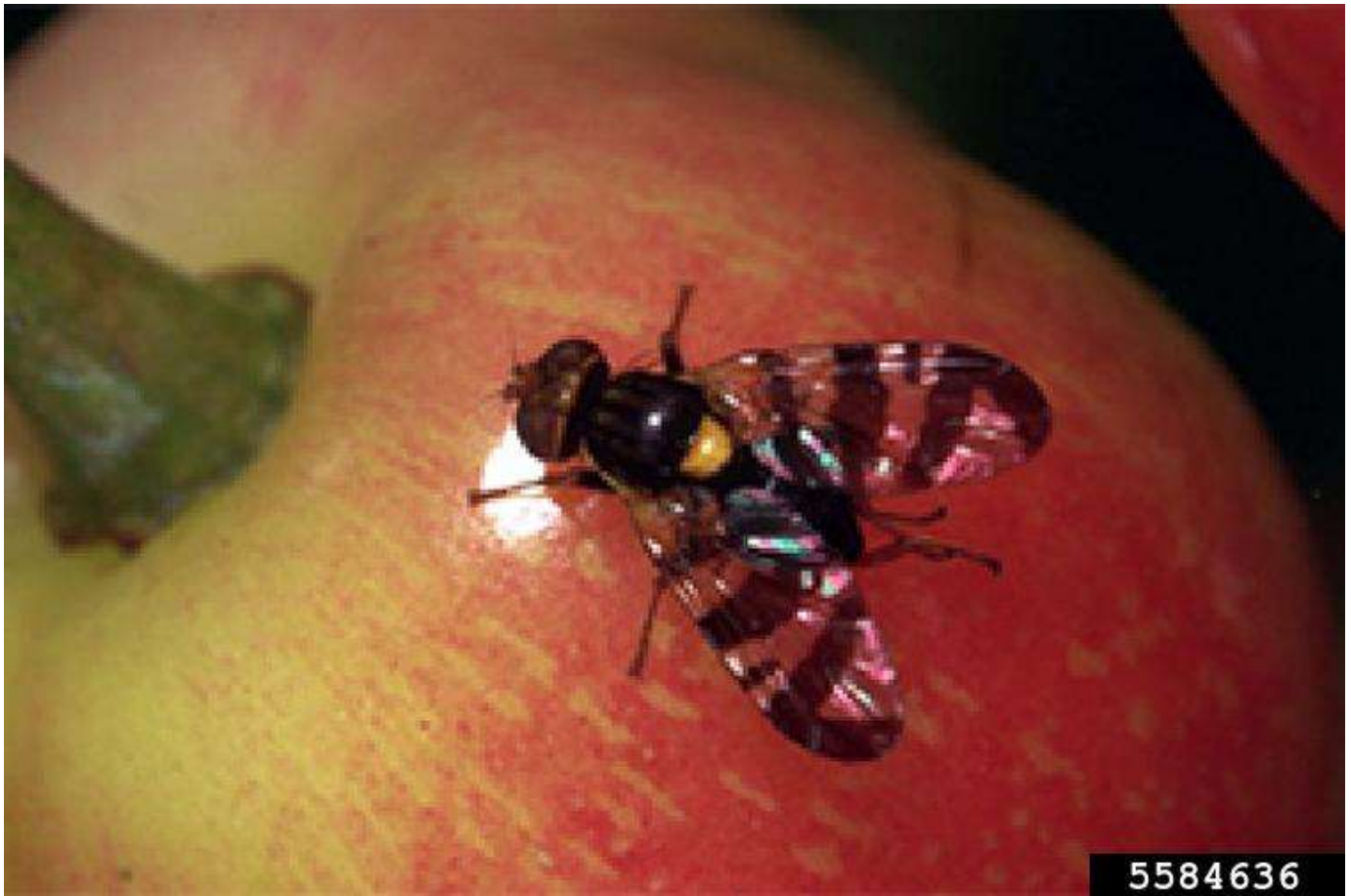
European Grapevine Moth