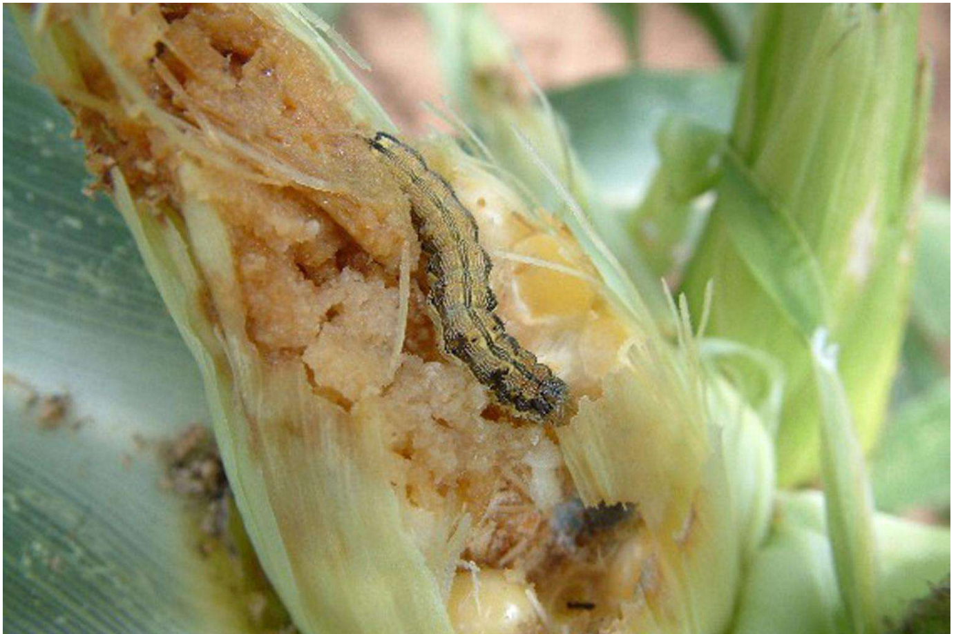
Oriental Fruit Fly