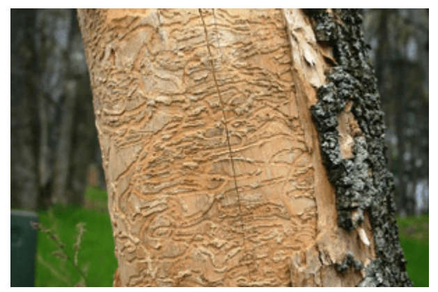
Larva Damage (S-shape)