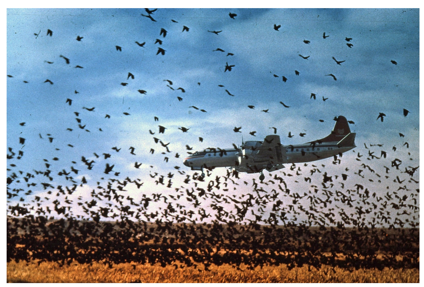
National Wildlife Disease Program

Wildlife Services provides Federal leadership and expertise to resolve wildlife conflicts that threaten public health and safety. Increased air traffic, urban sprawl, enhanced noise suppression on aircraft, and more concentrated populations of birds and other wildlife at or near airports contribute to wildlife strikes.