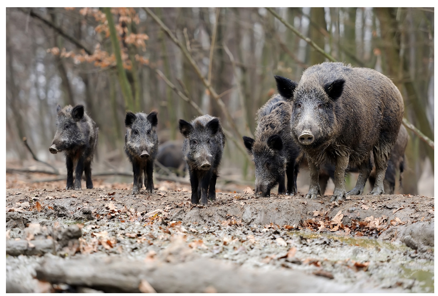
National Environmental Policy Act

View final NEPA documents from APHIS Wildlife Services, organized by State.