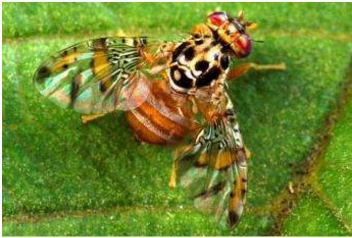
Mexican Fruit Fly

Anastrepha ludens , also known as mexfly