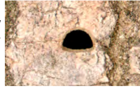
D-Shaped Emergence Hole