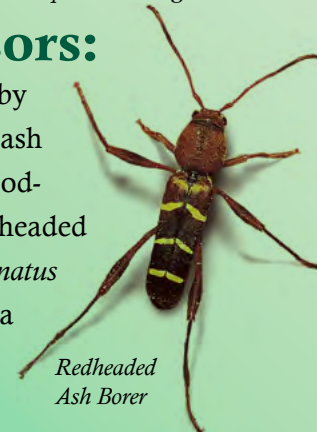
Redheaded Ash Borer

Ash may also be stressed by drought, diseases such as ash yellows, and by native wood-boring insects like the redheaded ash borer, Neoclytus acuminatus (Fabricius) which creates a round emergence hole.