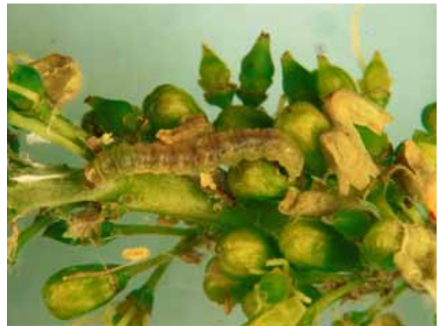
Lb 5th instar larva on a vine inflorescence