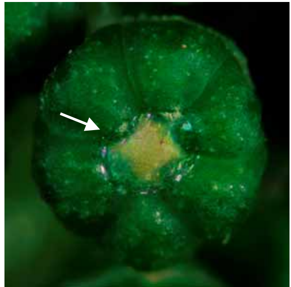
Lb: egg on the top of a vine flower calyptra