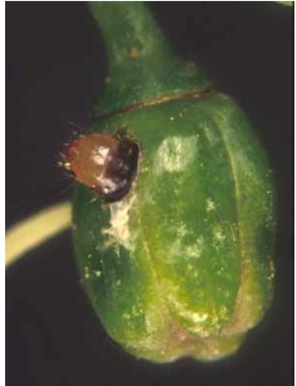
Lb 2nd instar larva within a flower bud