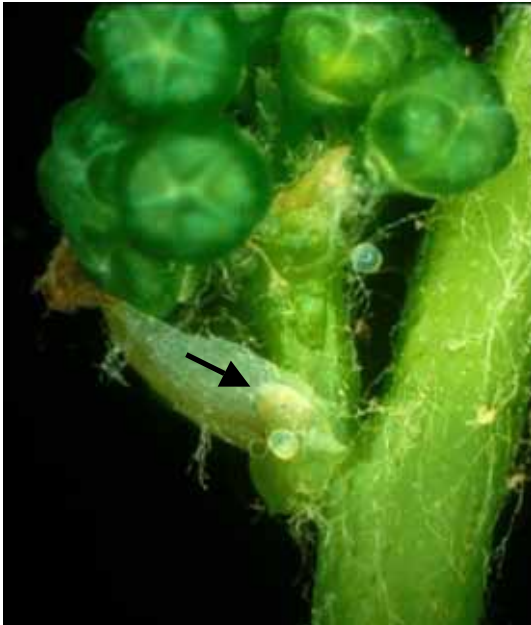
Lb: egg on a vine inflorescence bract near an exudate drop