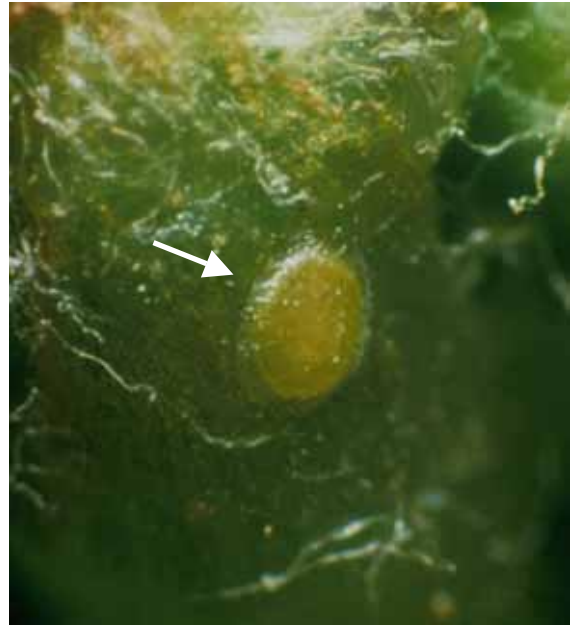
Lb: egg on a vine inflorescence bract