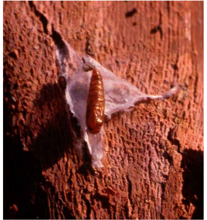
Lb: overwintering pupa within the silky cocoon (left); the same cut open, on the right.