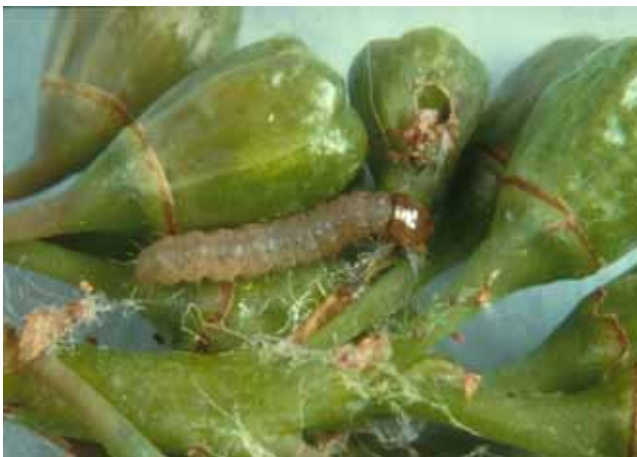
Lb 4th instar larva on a vine inflorescence