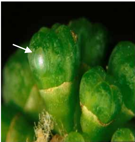
Lb: egg on the calyptra of a vine flower bud