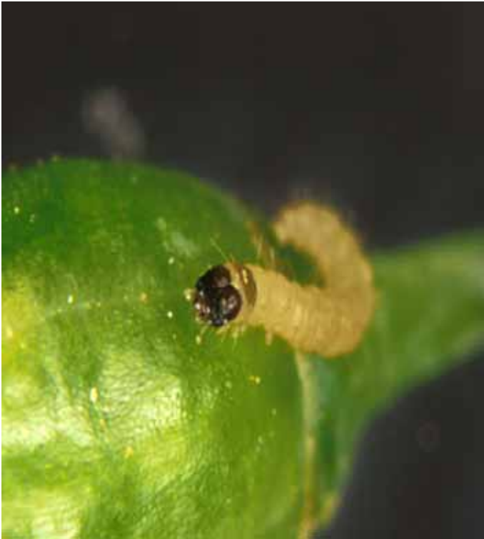
Lb 1st instar larva