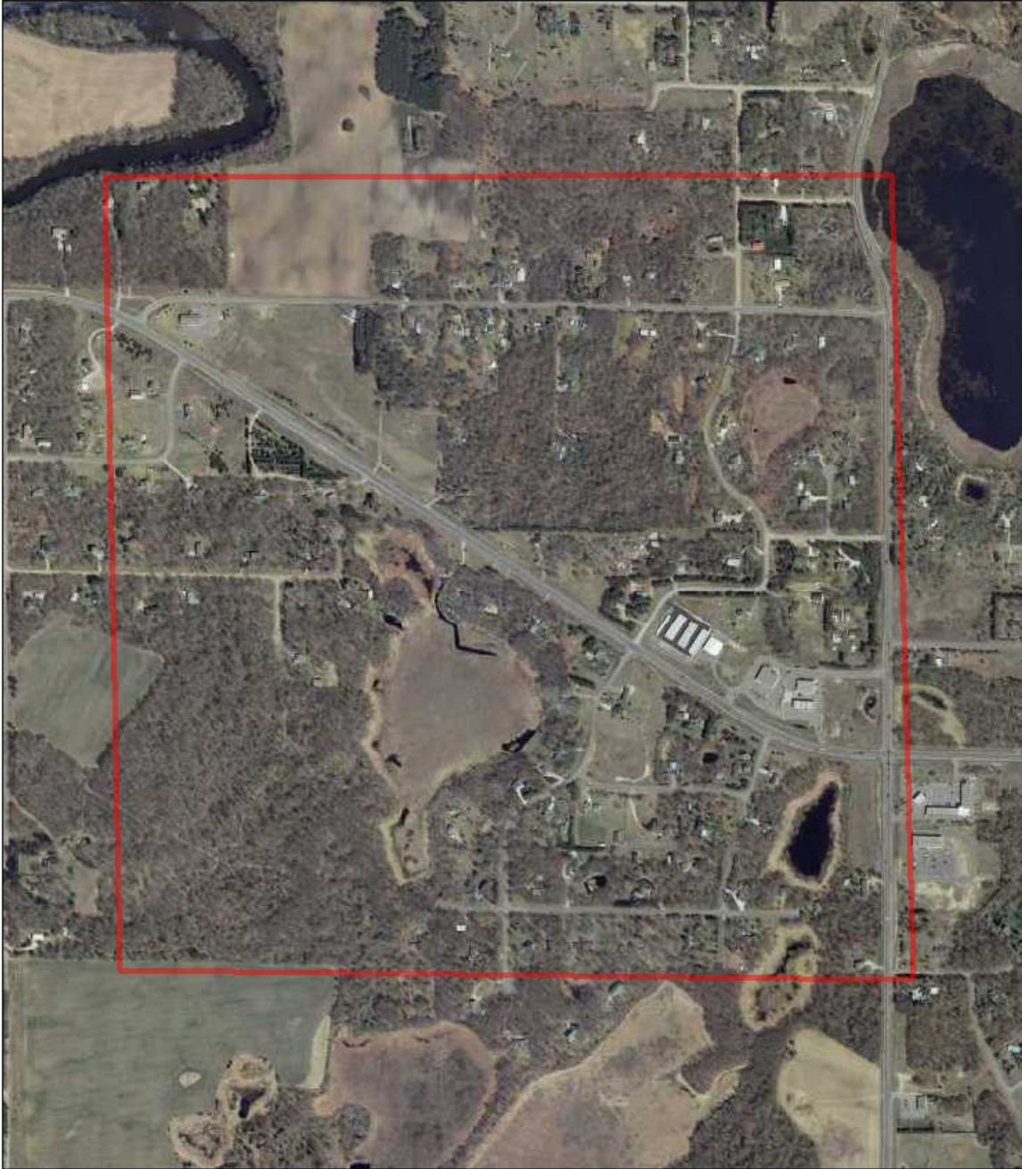
2015 Oak Grove Proposed Gypsy Moth Treatment Block