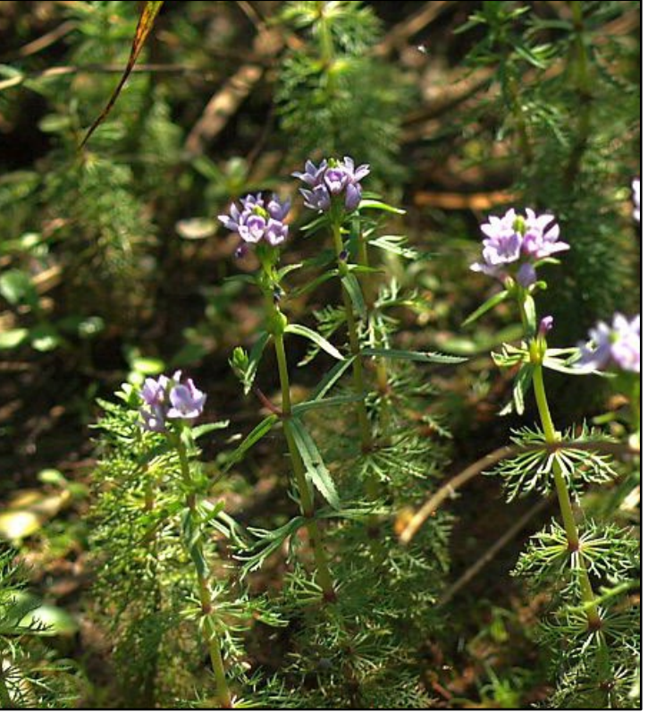
Limnophila heterophylla